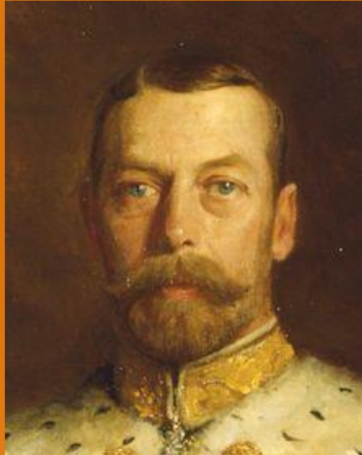
King George V.