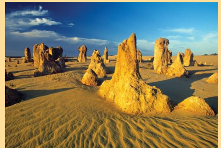
Most of the continent is sunny most of the year.

Much of the Australian life-style revolves around the outdoors and sport. Australians like to relax actively by bush walking, skiing, surfing, sailing, swimming, or any other activity that takes them into the sun and open air.