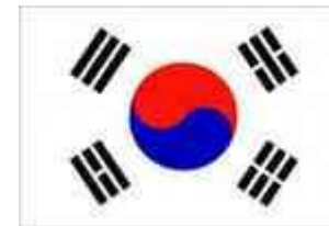
The Republic of KOREA