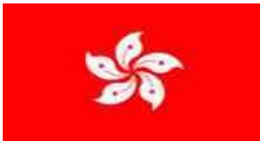
HONG KONG CHINA