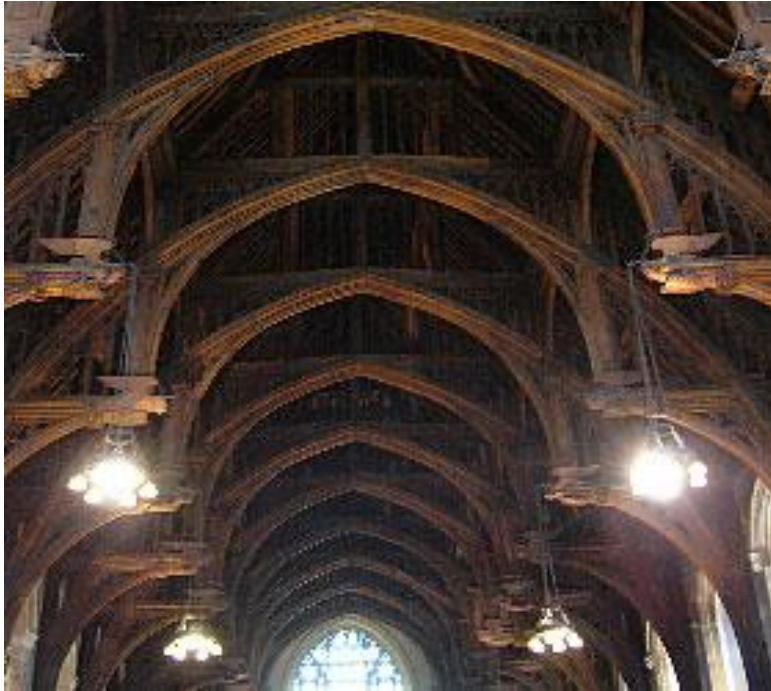
The medieval wooden ceiling of Westminster Hall (which survived the 1834 fire)

Westminster Hall was once used as a court. People who were put on trial here and condemned to death include William Wallace (1305), Guy Fawkes (1606) and Charles the First (1649). The high court moved to the Royal Courts of Justice (in the Strand) in 1825. Coronation banquets were held here until the rule of George the Fourth (1820-1830).