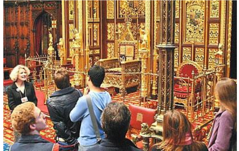
The throne in the House of Lords

The House of Lords is the upper house of the British Parliament. The main role of the House of Lords is to discuss carefully the new laws which are proposed by the House of Commons and to suggest changes when necessary. It can delay the passing of laws, but cannot stop them if the House of Commons wishes to go ahead. While the members of the House of Lords are in Parliament they may be taking part in a debate, examining laws in more detail in a committee, doing research, or perhaps dealing with a member of the public.