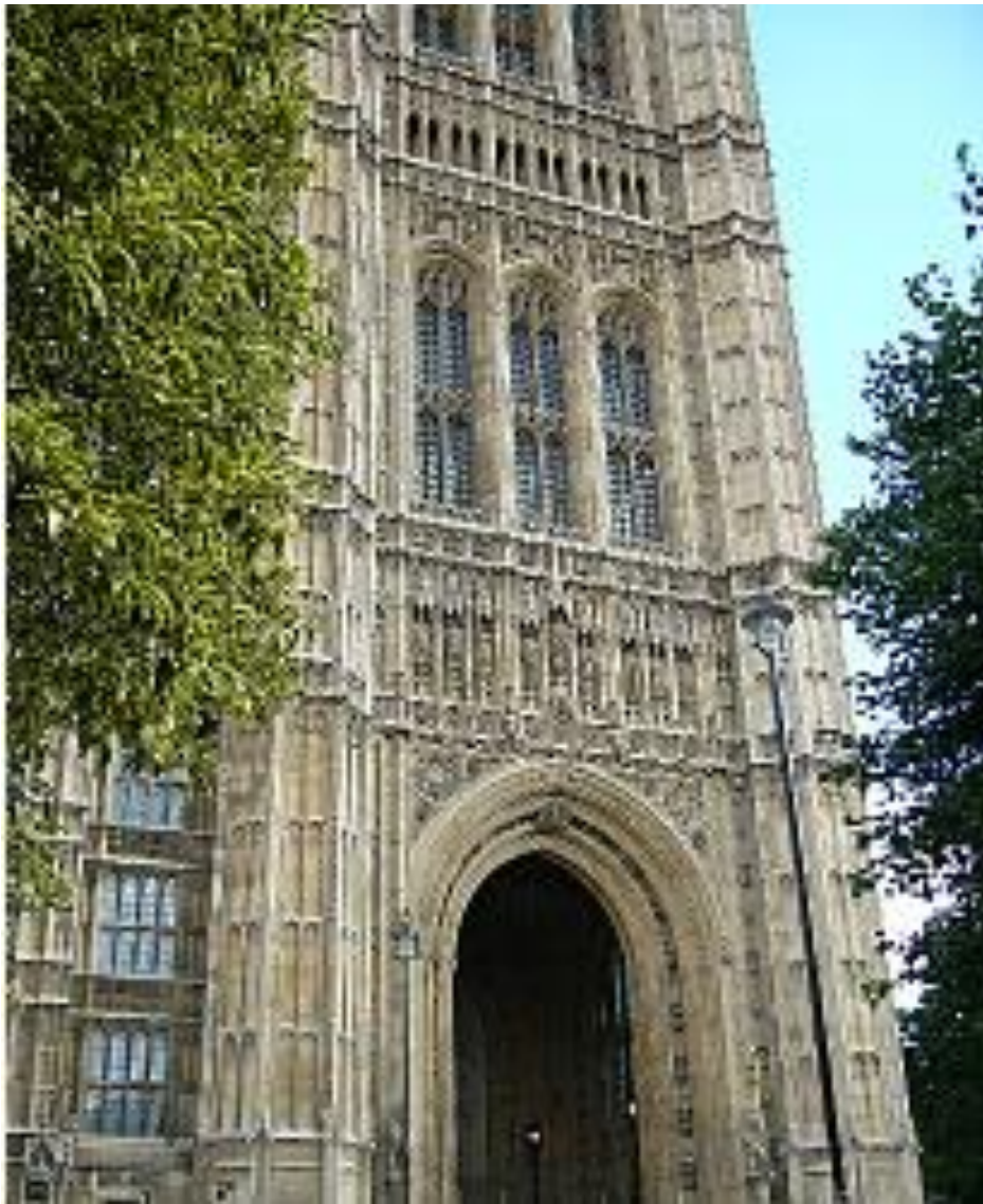
The Sovereign's Entrance at the bottom of Victoria Tower

Let's follow the route which the Queen takes once she has arrived for the State Opening ceremony.