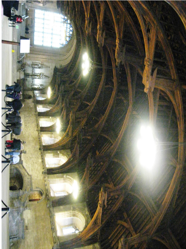
Great Hall inside Westminster Palace

I invite you to follow the route of a tour of the interior of the Houses of Parliament, starting at Victoria Tower and ending at the Great Hall. You can take a tour such as this in August and September each summer. This is when the parliament does not normally meet (unless there is an emergency) and is known as the Summer Opening of Parliament. There are no tours on Sundays or on the last Monday in August (a public holiday).