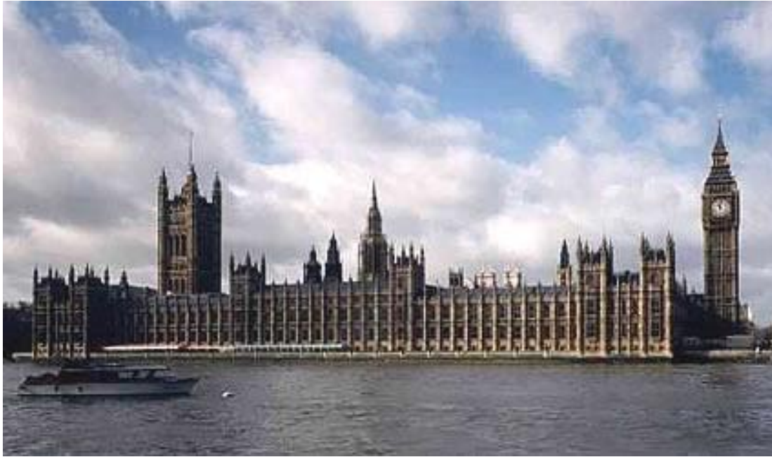
The Houses of Parliament (viewed from the south bank of the River Thames)

This is where the upper and lower houses of the British government (the House of Lords and the House of Commons) meet to decide national policies and to create new laws. The current buildings date from the period 1840-60, created after a fire in 1834 destroyed the previous parliament.