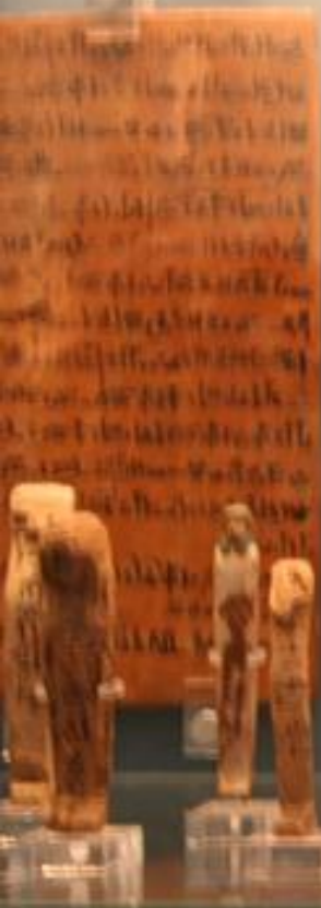
Wooden coffin of a woman, 18th dynasty, 1250-1200 BC, from Thebes, Egypt. The coffin is made of sycamore wood and is decorated with hieroglyphs and a false door. The smaller coffins are also made of sycamore wood and are decorated with hieroglyphs and a false door.