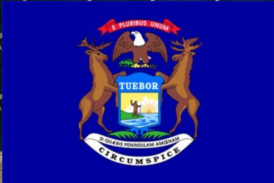
Flag of Michigan

The nickname of Michigan: "State of the Great Lakes," "Wolverine State"