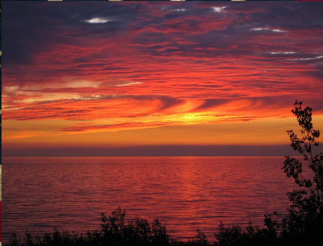
Sunset on Lake Michigan

In the west - is bordered by the waters of Lake Michigan