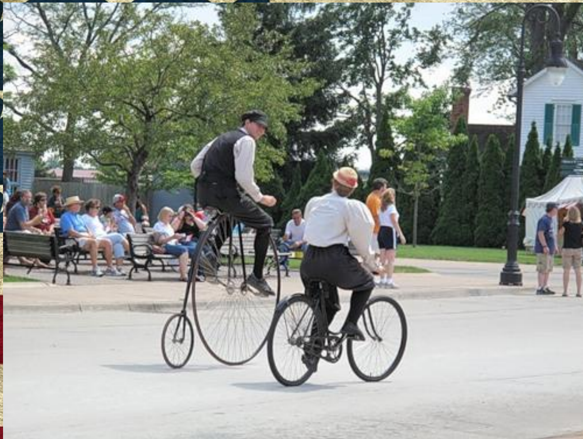
cyclists on the streets of Greenfield Village

Greenfield Village, five-kilometer waterfront park (38-hectare park with many historic buildings, vehicles, and several museums), as well as dozens of other cultural and sports facilities.