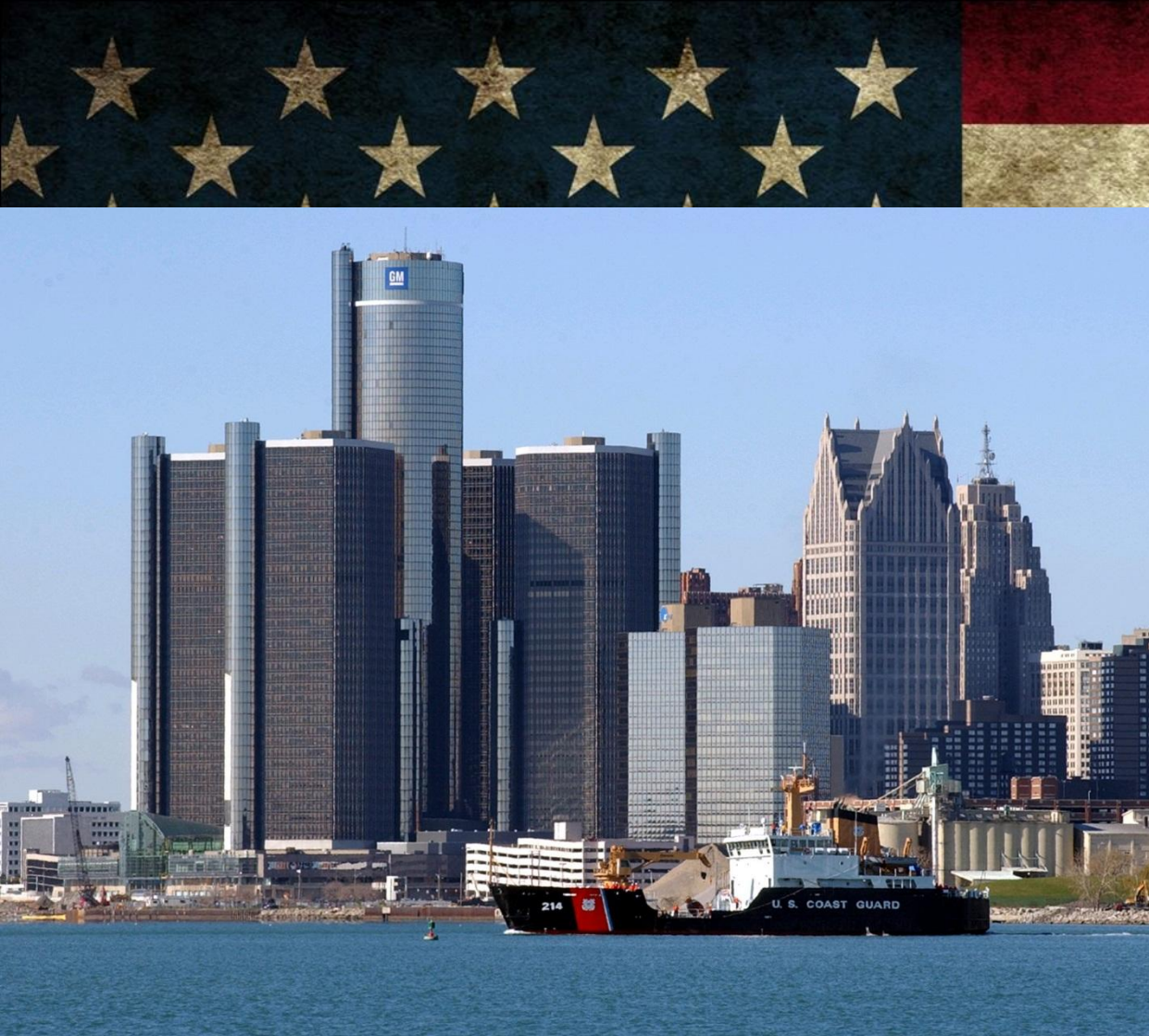
Cultural Center General Motors

A few miles north of downtown Cultural Center is located, the world-famous galleries and museums - a collection of the Detroit Institute of Arts