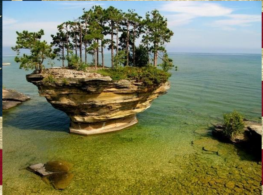
Lake Huron and unusual island on it

In the north and east of Michigan is bordered by the waters of Lakes Superior and Huron