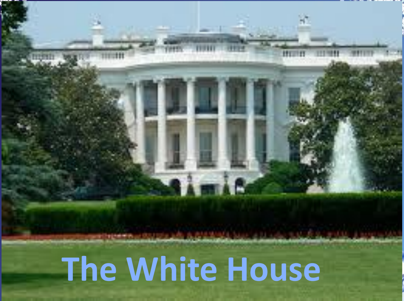
The White House