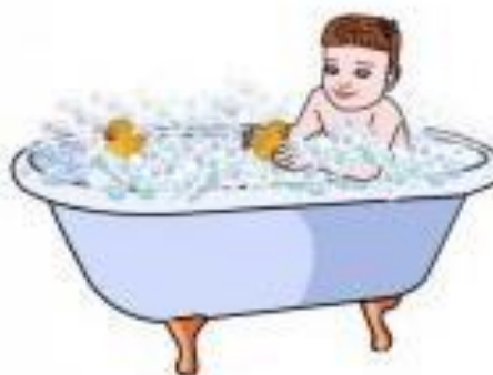
take a bath