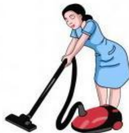
clean the house