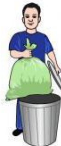
take out the trash