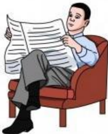
read the paper