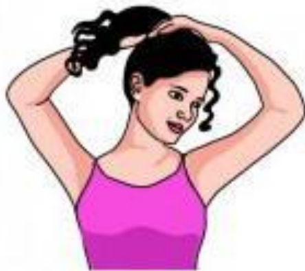
do your hair