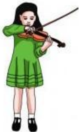
play an instrument