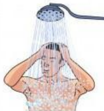
take a shower