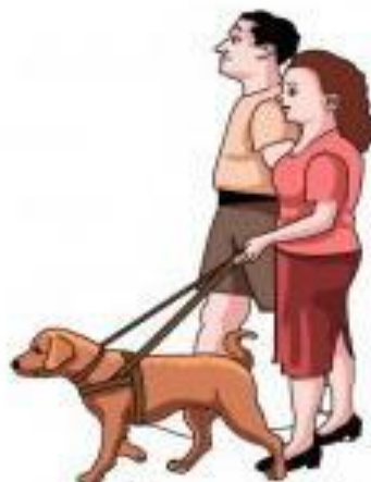
go for a walk