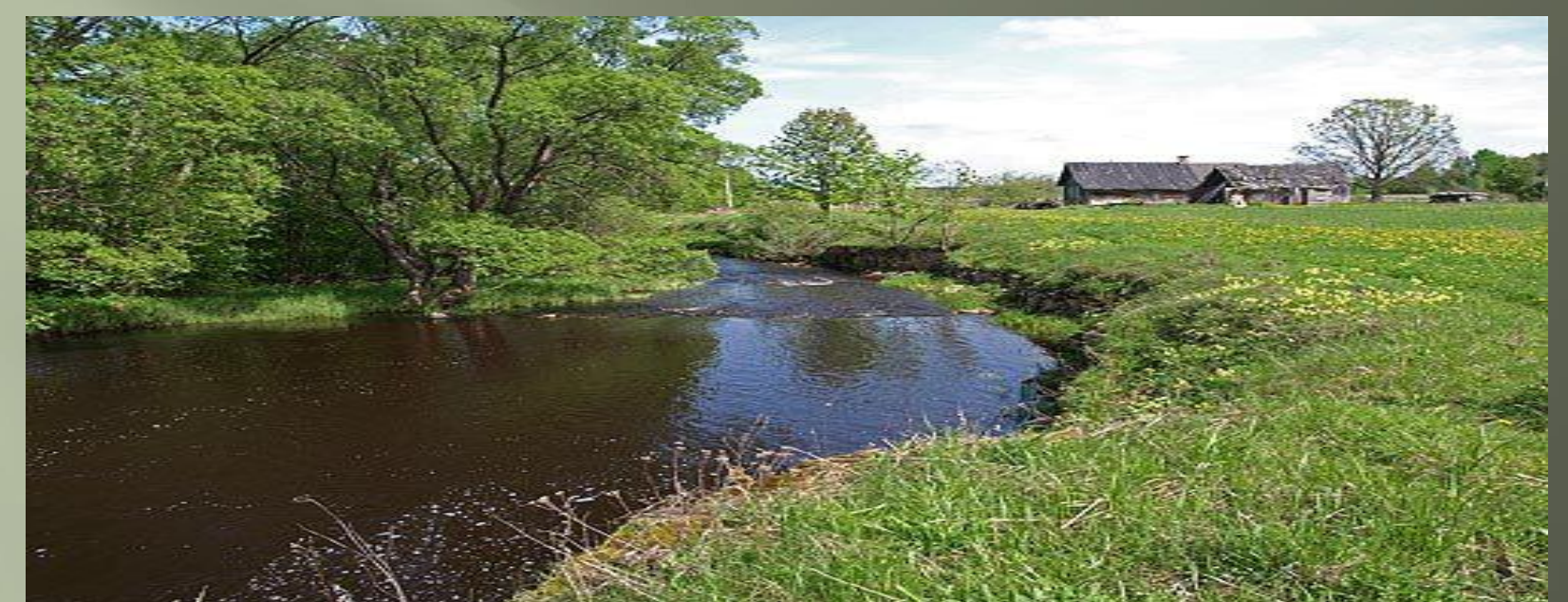
The summer months are: