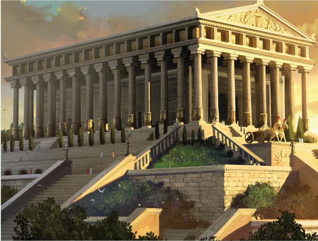
The Temple of Artemis