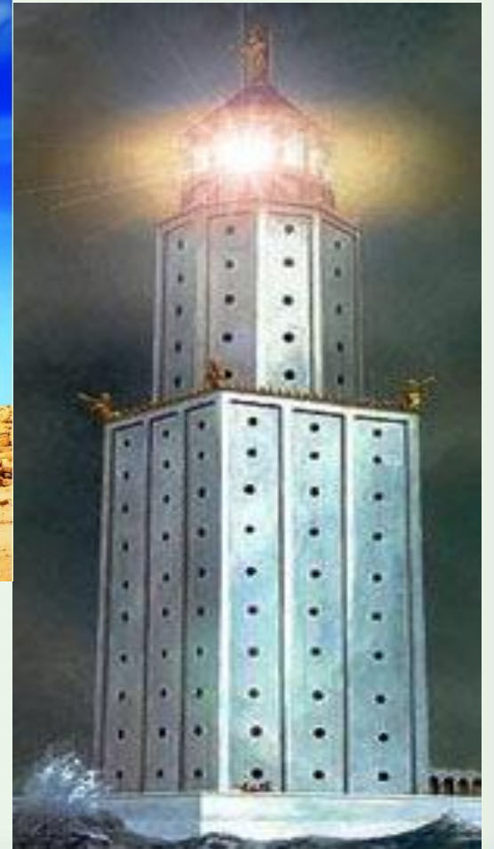
The Lighthouse of Alexandria