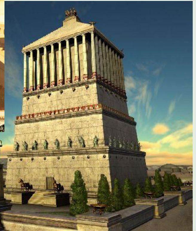
The Mausoleum of Halicarnassus