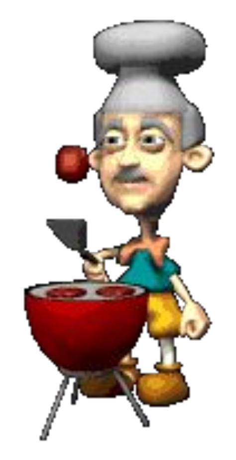
Yesterday he cooked At 8 p. m. yesterday tasty dinner.