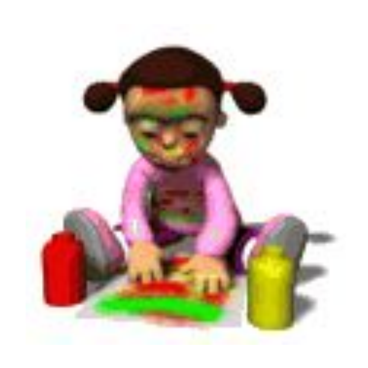
my little sister / draw funny pictures