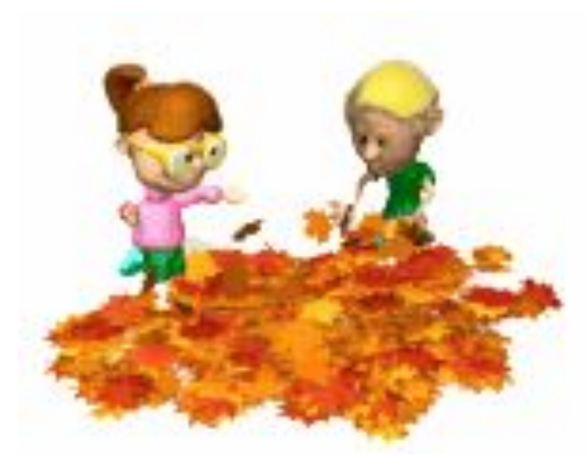
walk in the forest