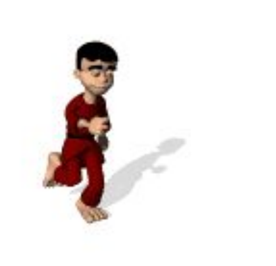
At 11 a. m. last Sunday I ...