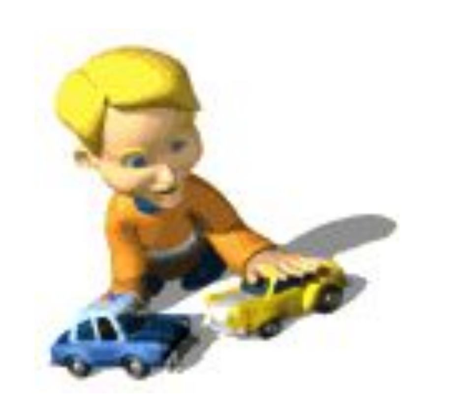
play with my toys