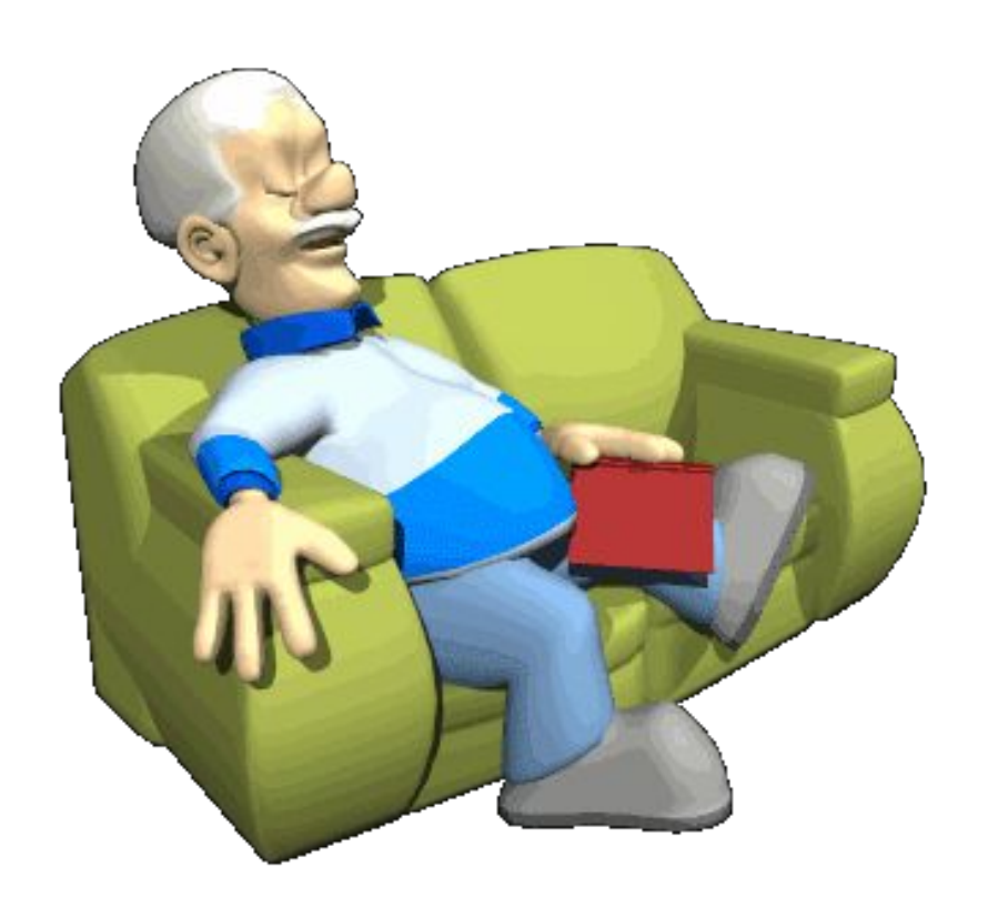
my granddad / sleep