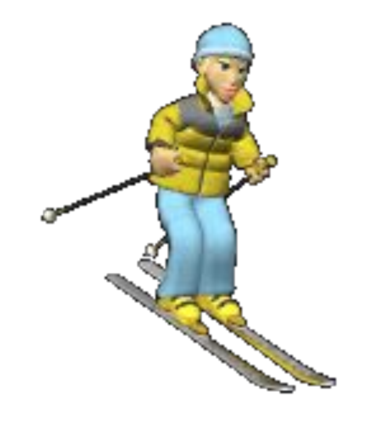
Last year she skied in Norway.