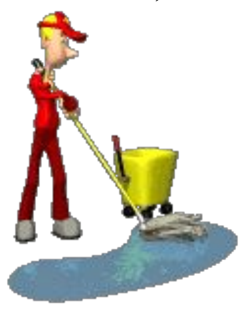
wash the floor