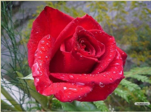
The national symbol of England