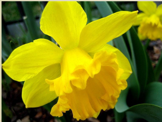
The national symbol of Wales