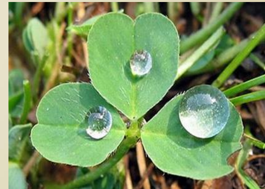
The national symbol of Northern Ireland