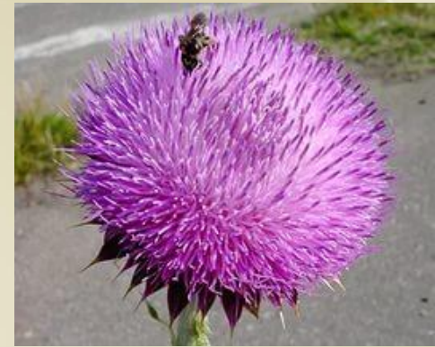
The national symbol of Scotland