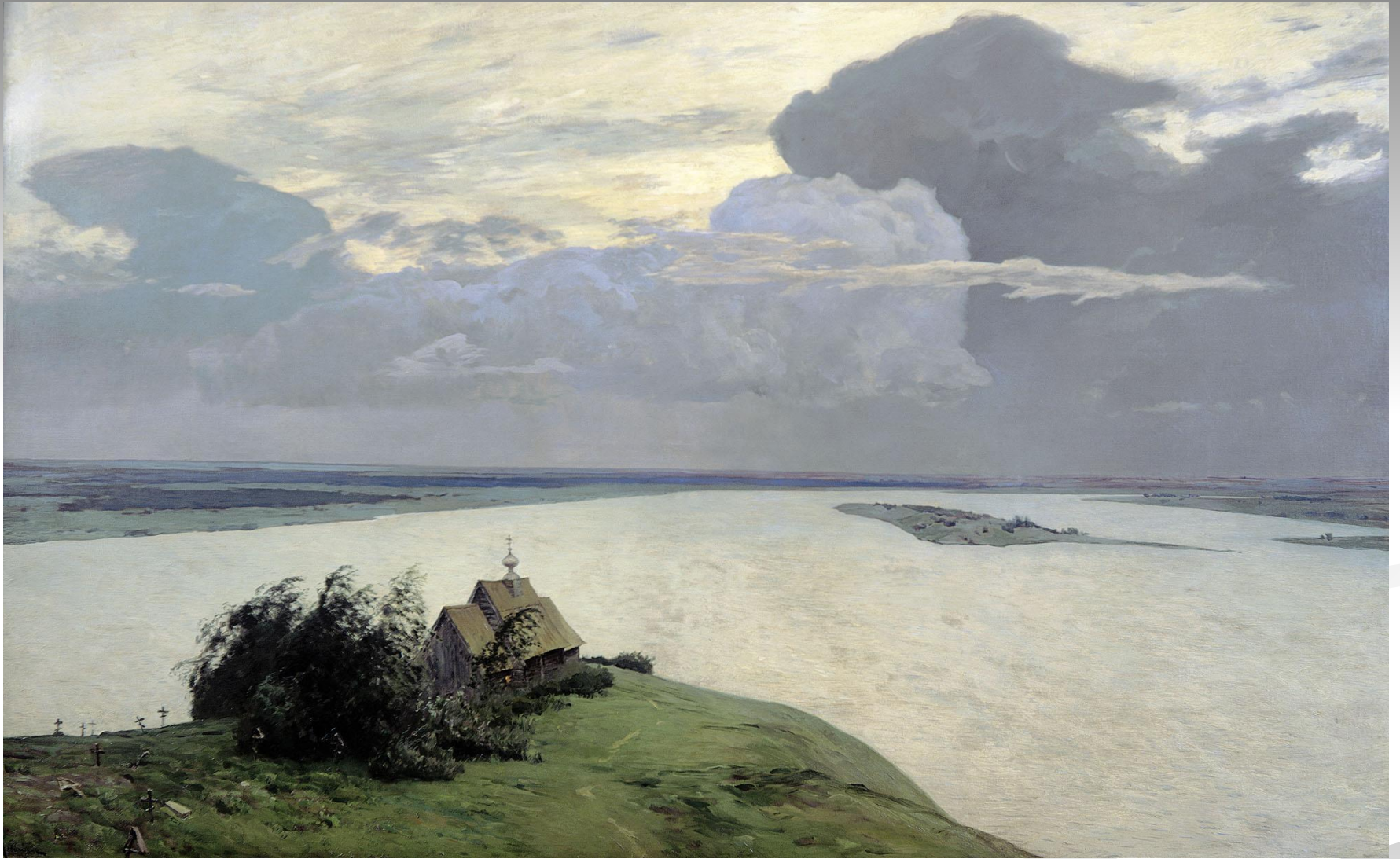
“Over Eternal Peace”,