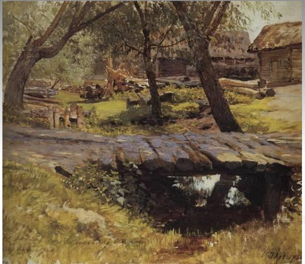
“Bridge. Savvinskaya Sloboda”, 1884