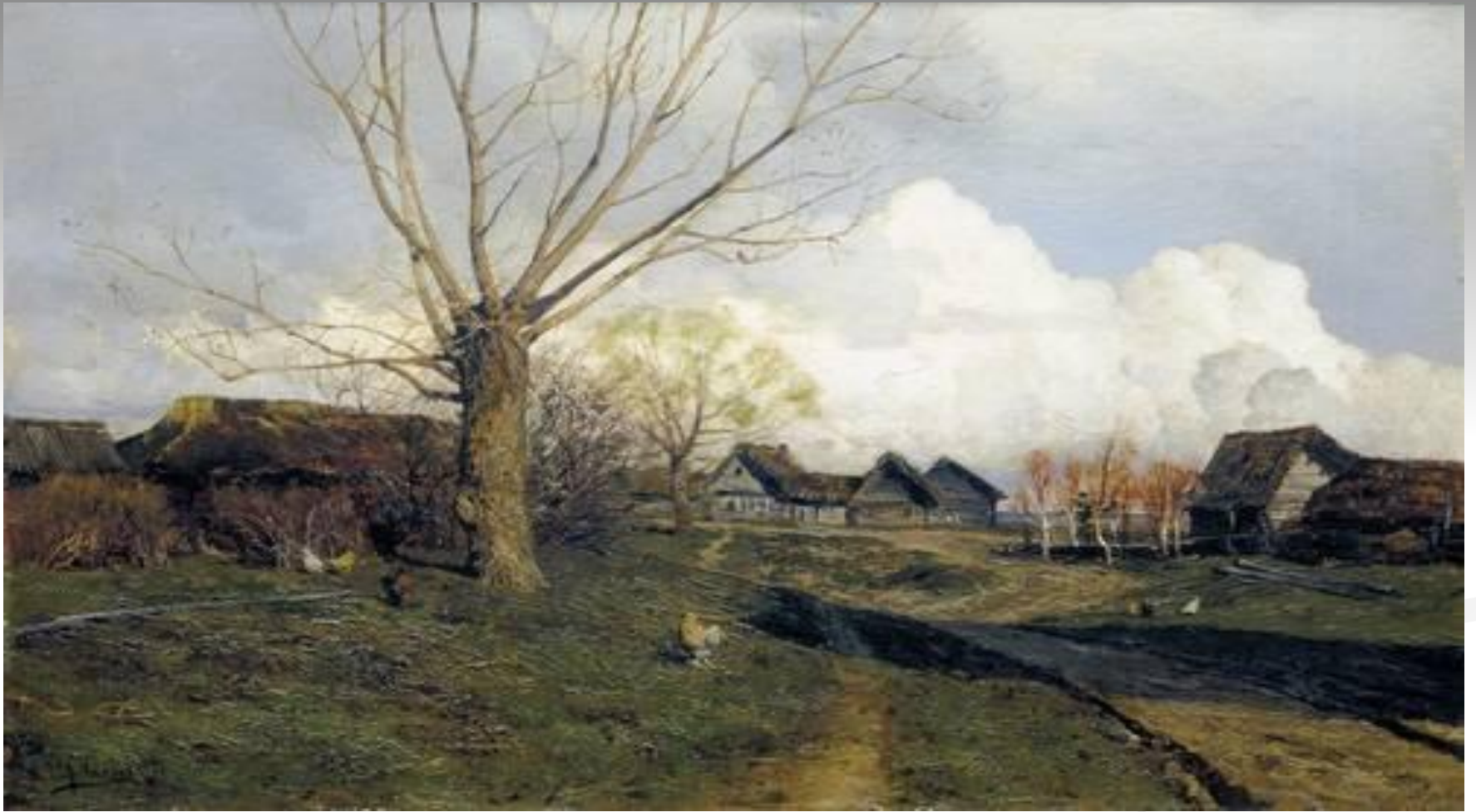
Savvinskaya Sloboda near Zvenigorod, 1884