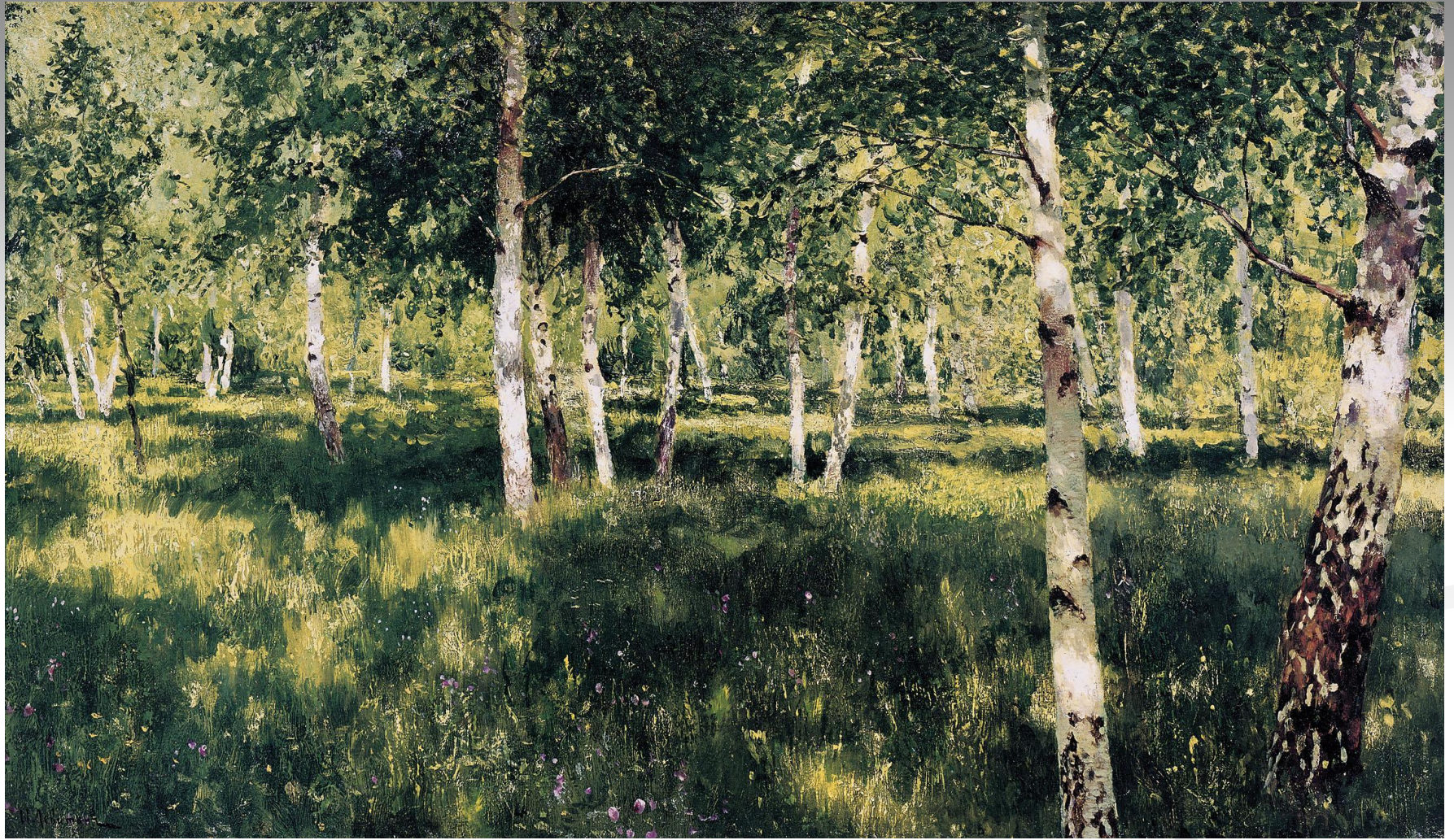
“Birch Grove”, 1885 - 1889