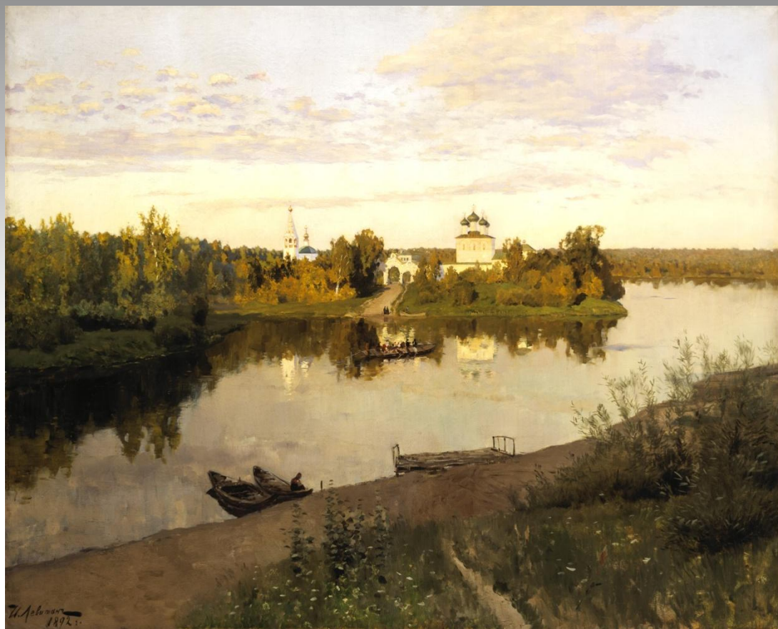
“Evening Bells”, 1892