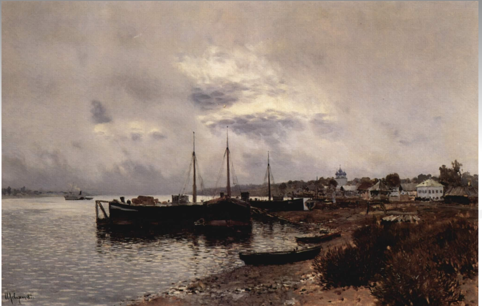
“Shore” ( Плѣс )