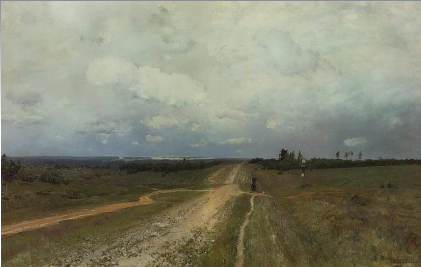
“The Vladimirka”, 1892