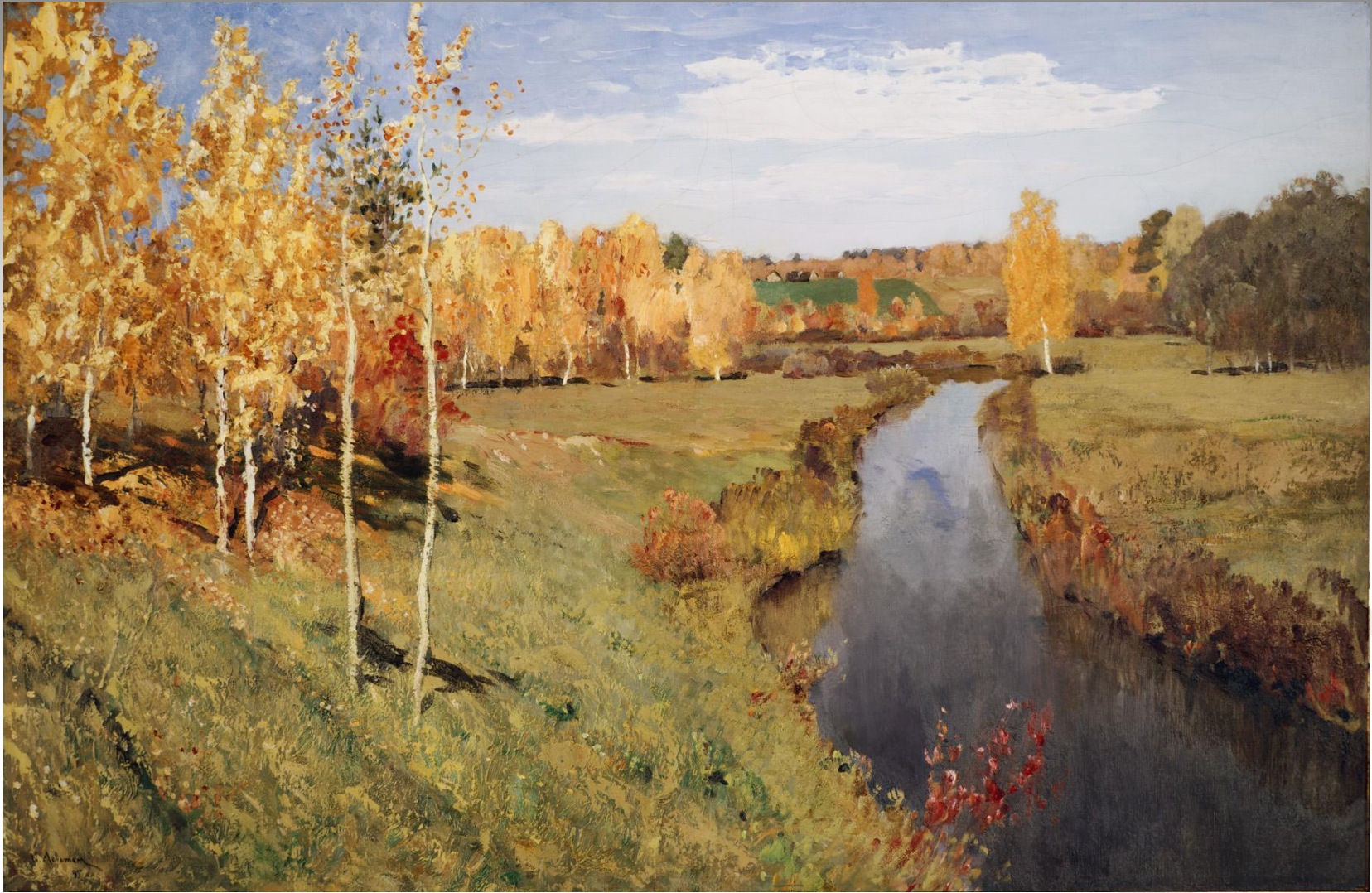
“Golden Autumn”, 1895