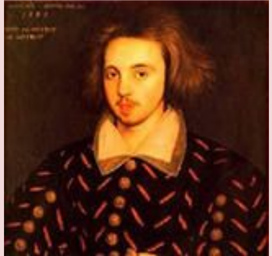
• Christopher Marlowe