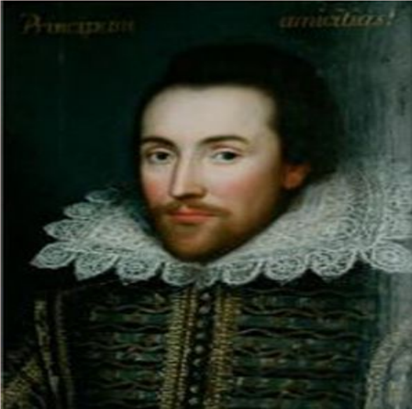
• William Shakespeare

The Elizabethan age was one of the greatest periods of English literature.