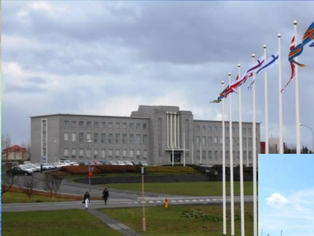
University of Iceland (1911) (public)