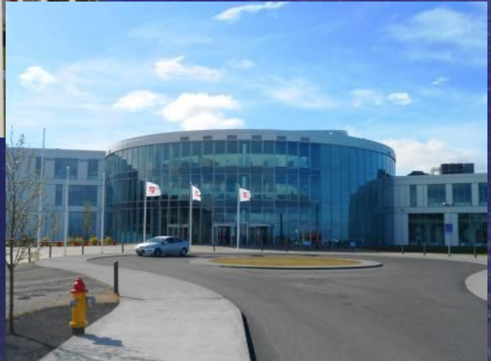
Reykjavik University (1998) (private)