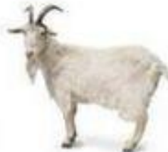
Billy goat (male)