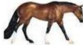
mare (female horse)