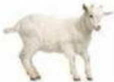
kid goat (baby)