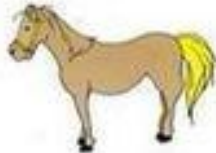
colt (baby horse)