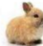
bunny or kit (baby)