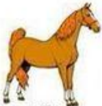
stallion (male horse)