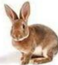
buck (male rabbit)