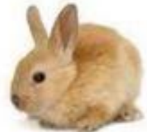
doe (female rabbit)