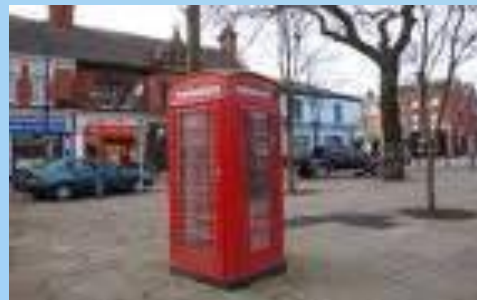
A phone box