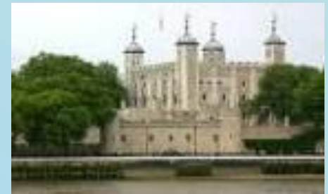
The Tower of London