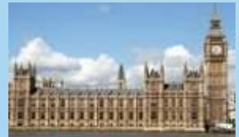
Houses of Parliament