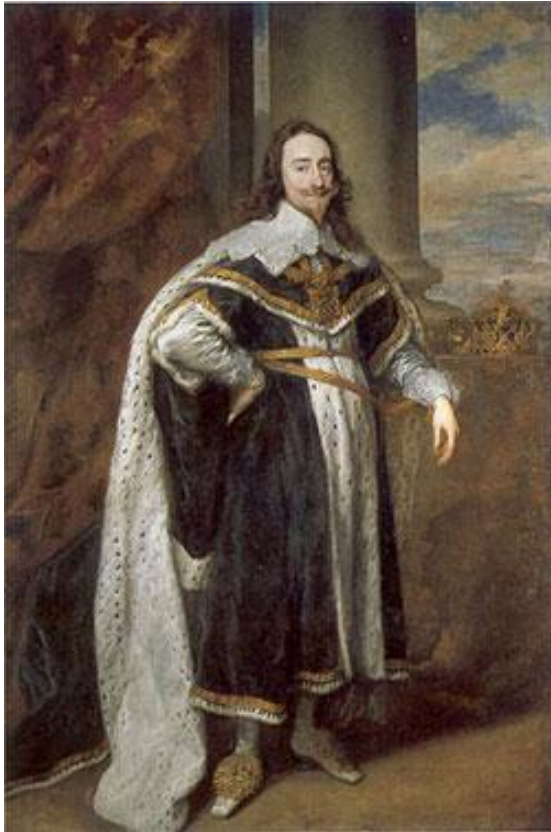
King Charles I

Over thirty Native American tribes living in the South Carolina region made European settlement difficult here. Beginning in 1670, British colonists managed to establish Charles Town (Charleston). Following the Revolutionary War, South Carolina joined the Union as the eighth state on May 23, 1788. Almost a century later, the state left the Union and the Civil War began at Fort Sumter. Racial discrimination continued in South Carolina for many years after the Civil War.