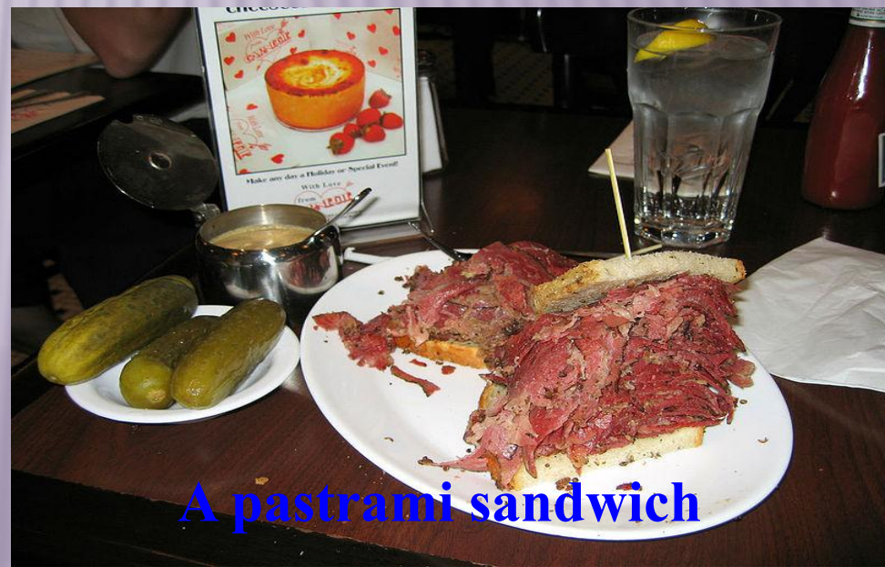
A pastrami sandwich