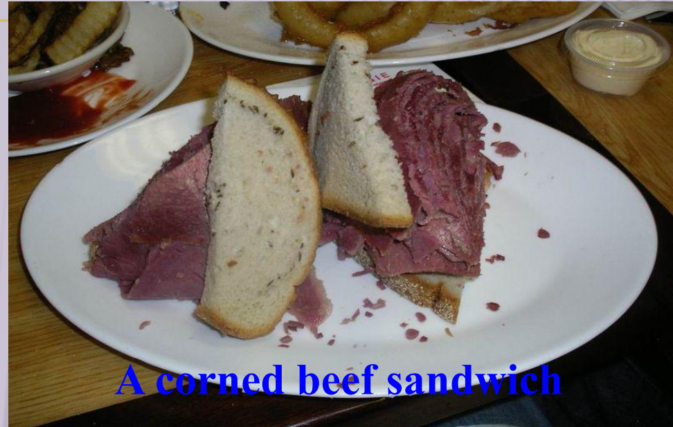
A corned beef sandwich