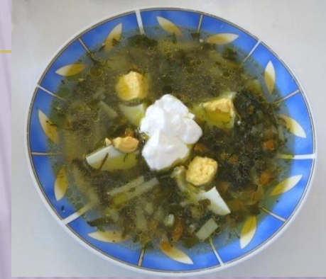
Sorrel-based green borscht