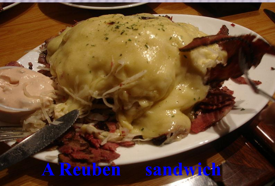
A Reuben sandwich