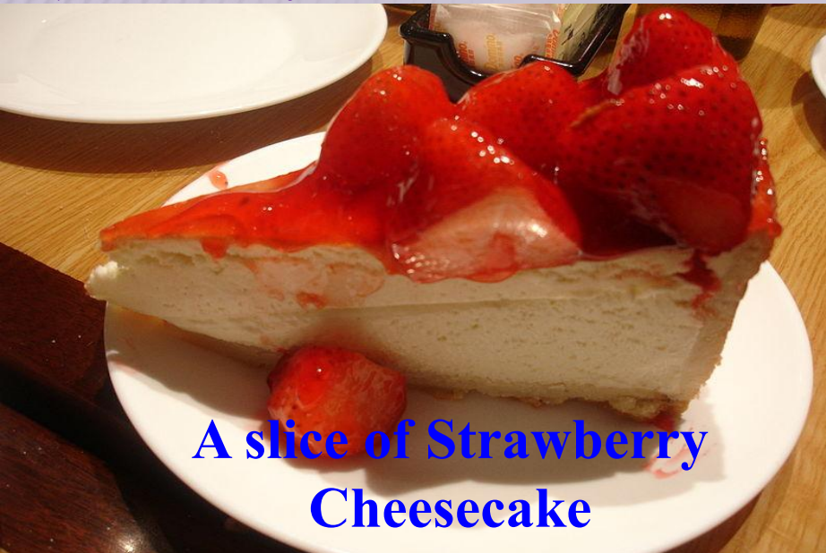
A slice of Strawberry Cheesecake

WHAT KIND OF FOOD CAN YOU GET IN THIS RESTAURANT? WILL MISHA, MARK AND ROB FIND SOMETHING THAT EACH OF THEM LIKES IN THE DELI?