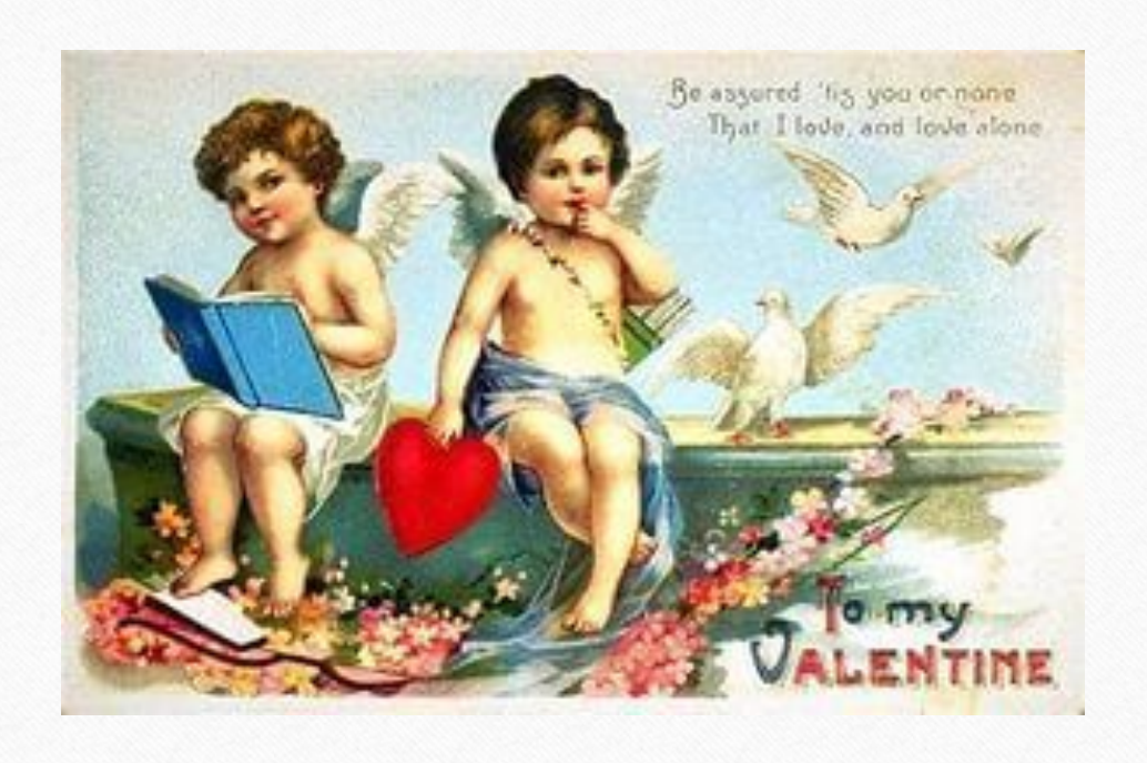
St. Valentine's Day is celebrated on February 14