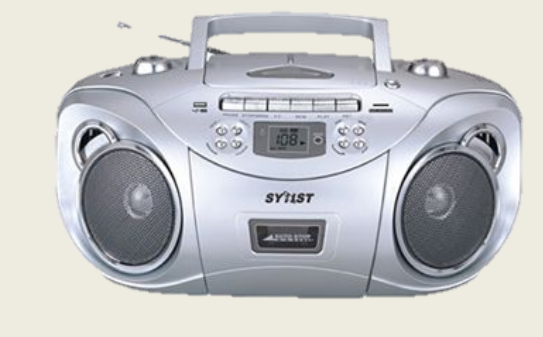
Radio cassette player