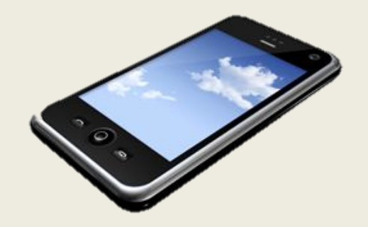
Video mobile phone