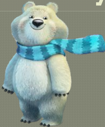
A White Bear