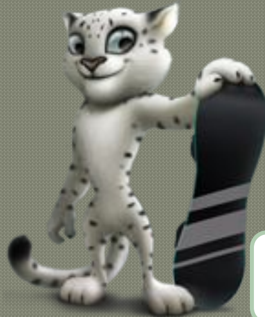
A Snow Leopard