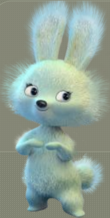
A White Hare