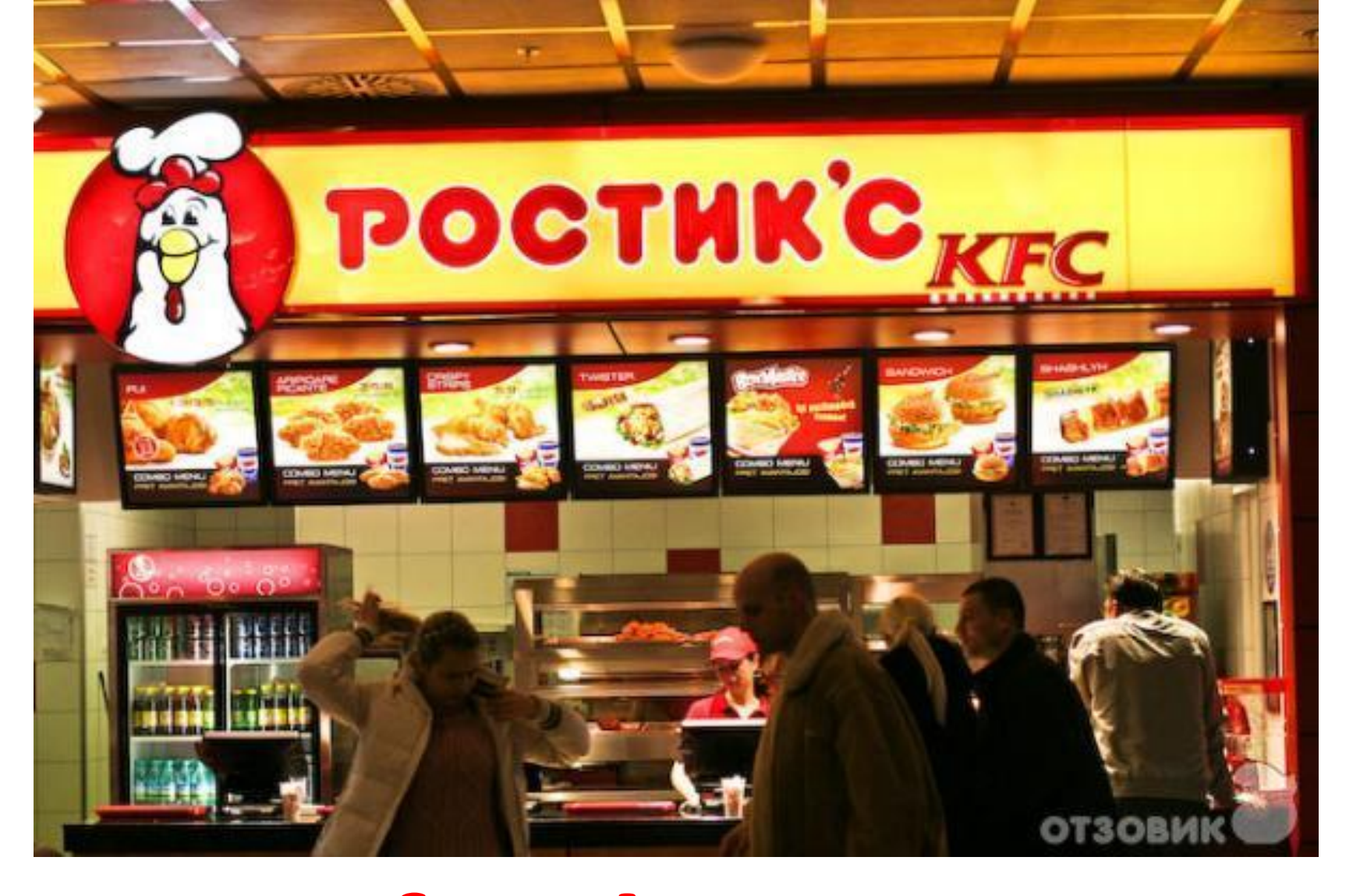
Fast food restaurant