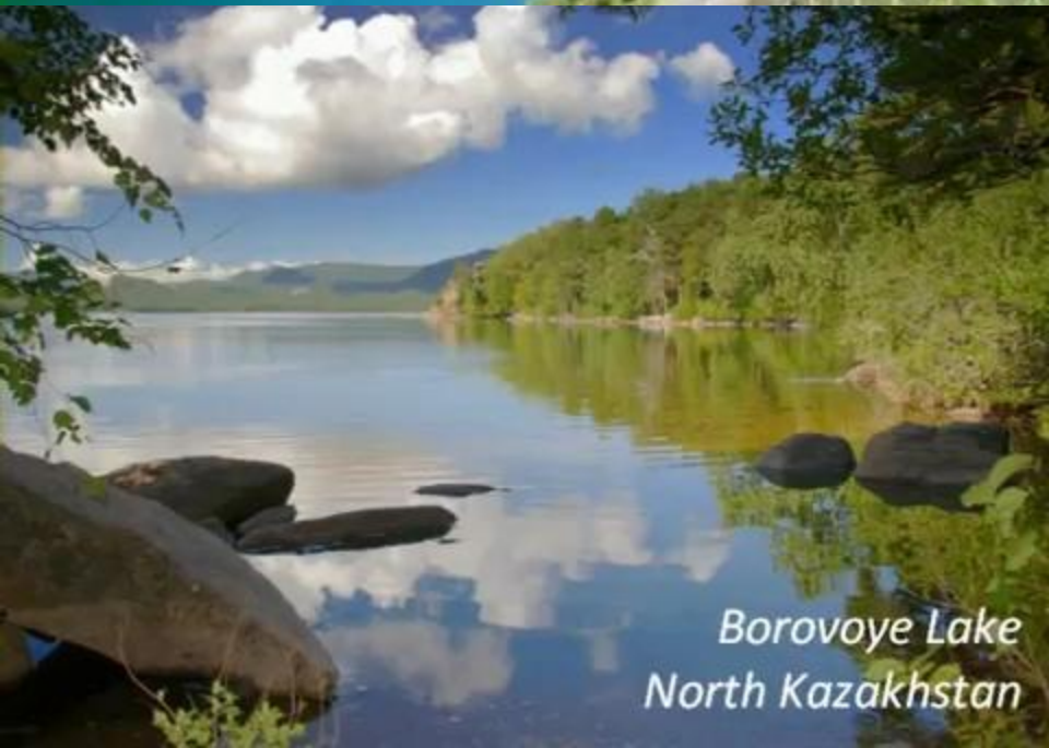
Borovoye Lake North Kazakhstan