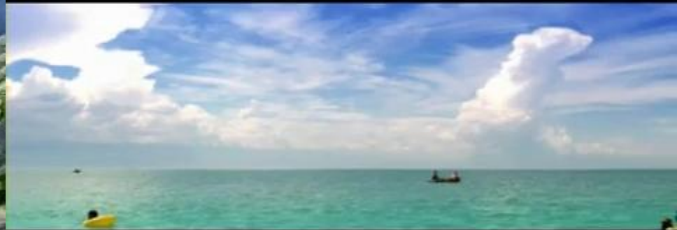
Alakol Lake East Kazakhstan