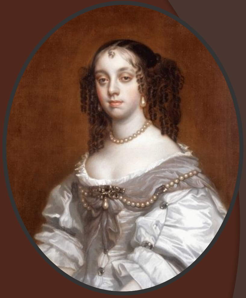
Catherine of Braganza

In 1662 Prince Charles II married the Portuguese princess, Catherine of Braganza, who brought to the court the habit of drinking tea.