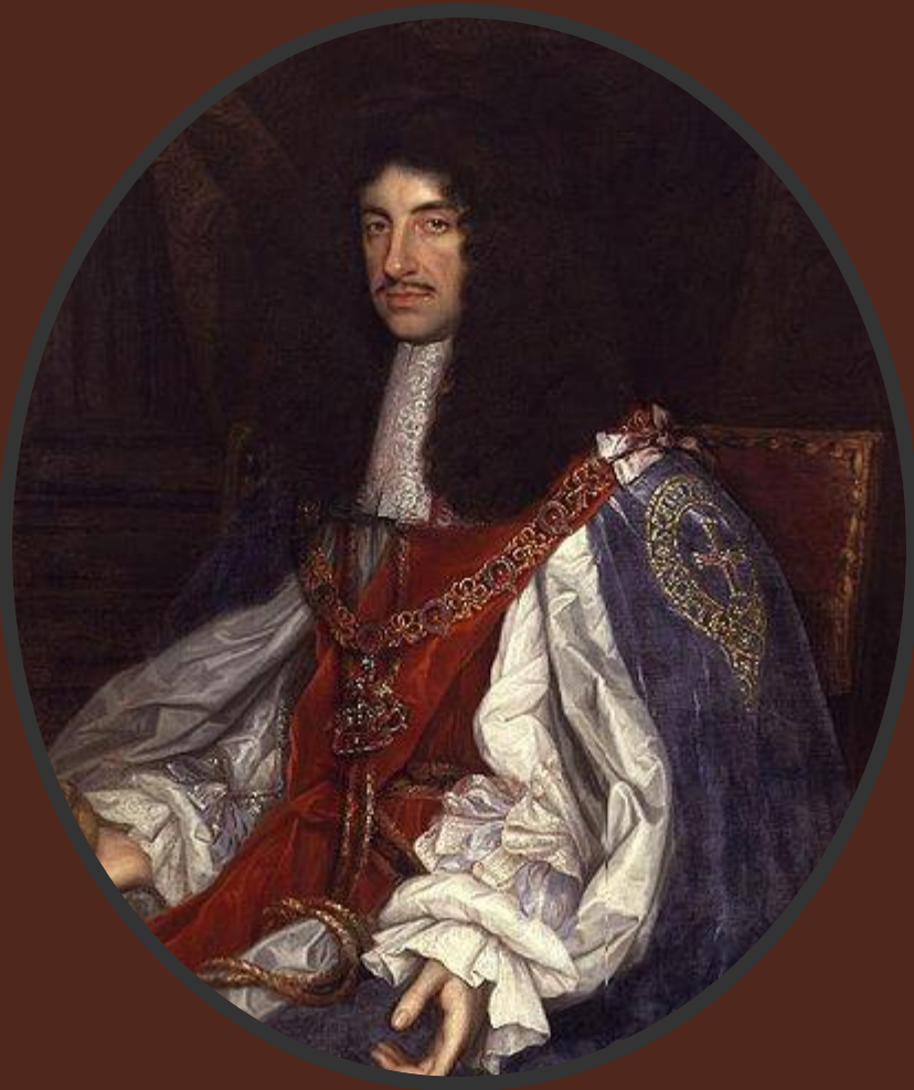
Prince Charles II