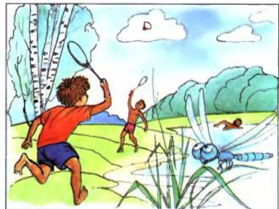
... in Russia.