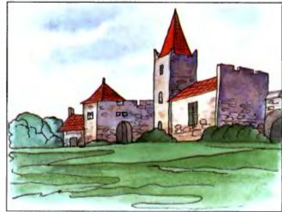
... in Britain.