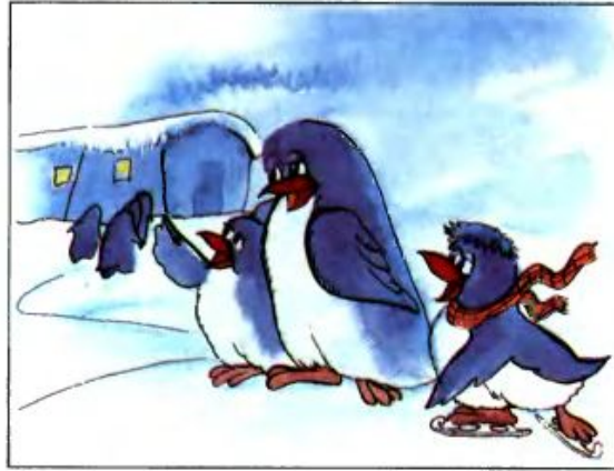
It's ... in Antarctica.