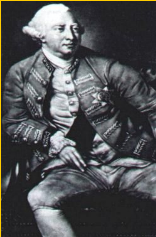
King George III.

The colonies were governed from England by the King George III. The governors of most of the colonies were appointed by The King himself.