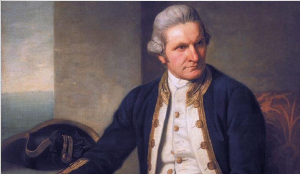
Captain James Cook