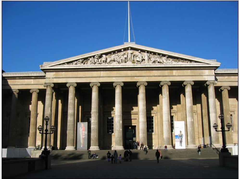
The British Museum