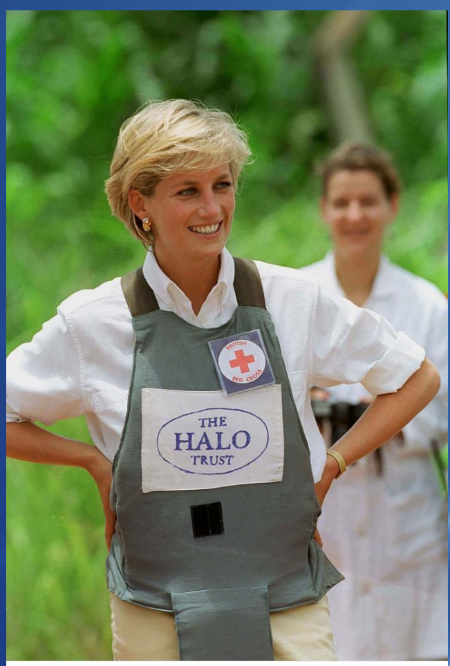
DIANA, PRINCESS OF WALES IN ANGOLA DURING A VISIT TO AN AREA BEING CLEARED OF MINES BY THE HALO TRUST