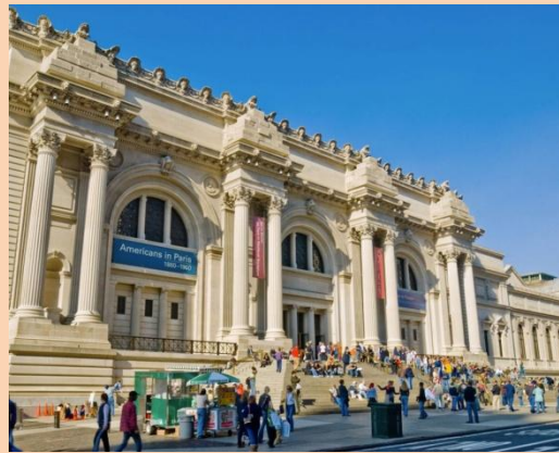
The Metropolitan Museum