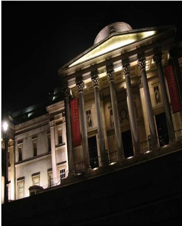
London, Trafalgar Square, 2007