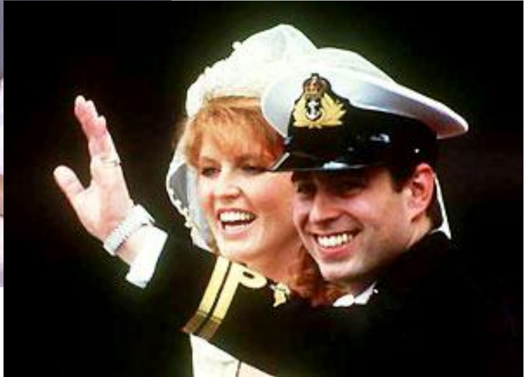
Andrew Albert Christian Edward and Sarah Ferguson