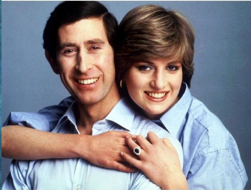
Charles Philip Arthur George and princess Diana