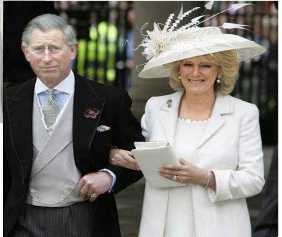
Charles Philip Arthur George and Camilla Parker Bowles