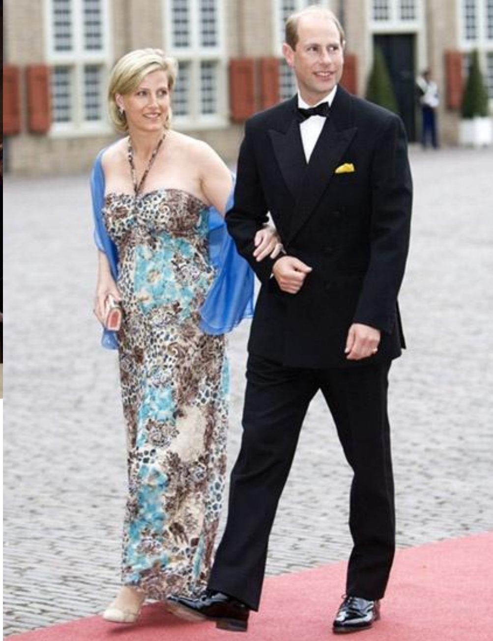
Edward Anthony Richard Louis and Sophie Rhys-Jones