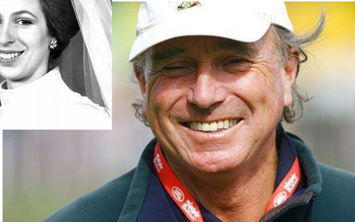
Anna Elizabeth Alice Louise and Captain Mark Phillips