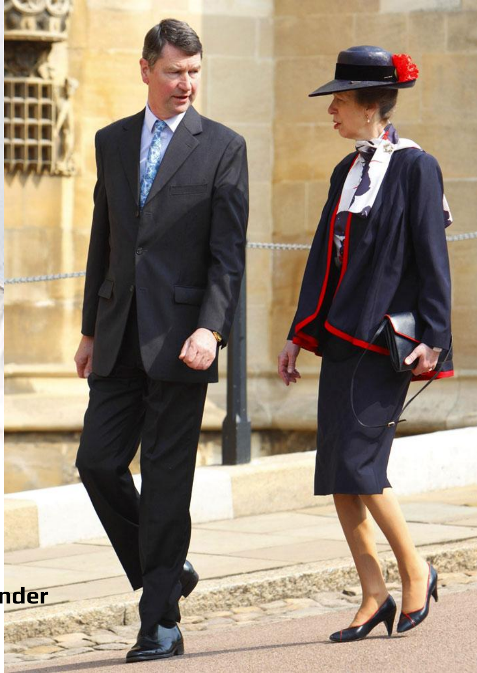
Anna Elizabeth Alice Louise and Commander Timothy Laurence