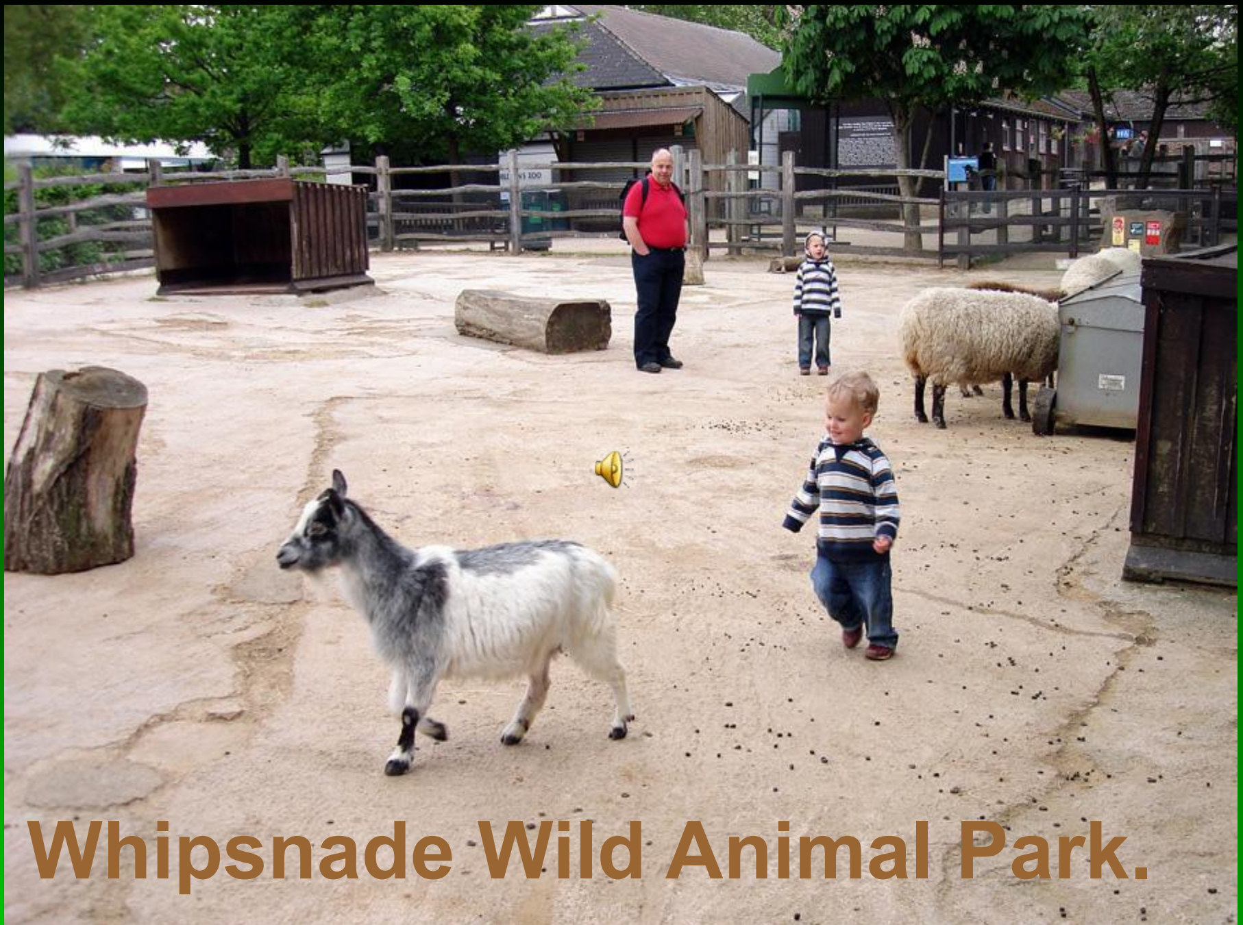
Whipsnade Wild Animal Park.