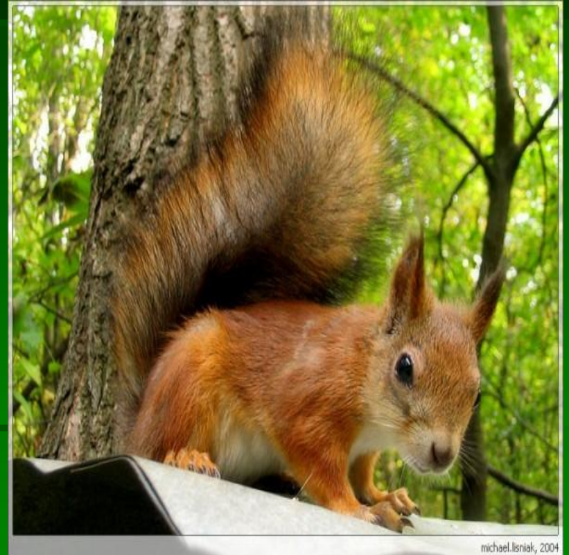
wild animal park