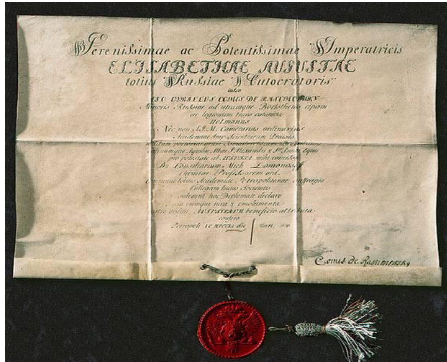
The Professor of chemistry diploma

□ In 1742 Lomonosov was appointed as an adjunct of physics at the St. Petersburg Academy of Sciences. At the age of 34 Mikhail Vasilyevich became a Professor of chemistry.