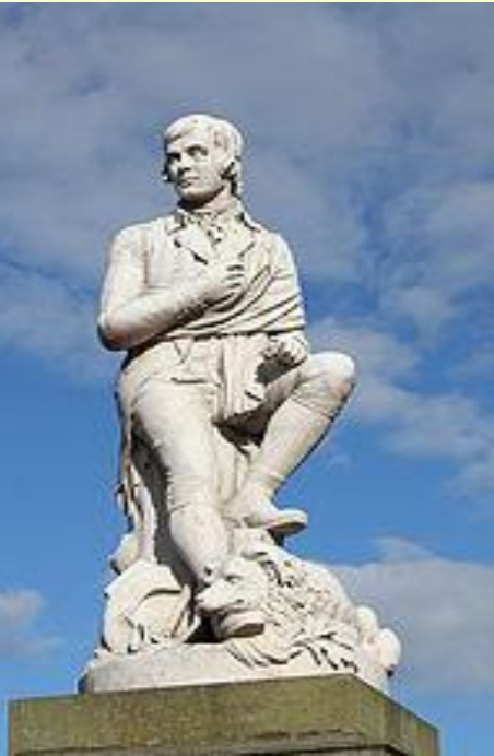
Statue of Burns in Dumfries Town Centre

Robert Burns lived, worked and died in Dumfries, Scotland. The Burns Howff Club is a society celebrating his life, works and contribution to Scottish heritage.