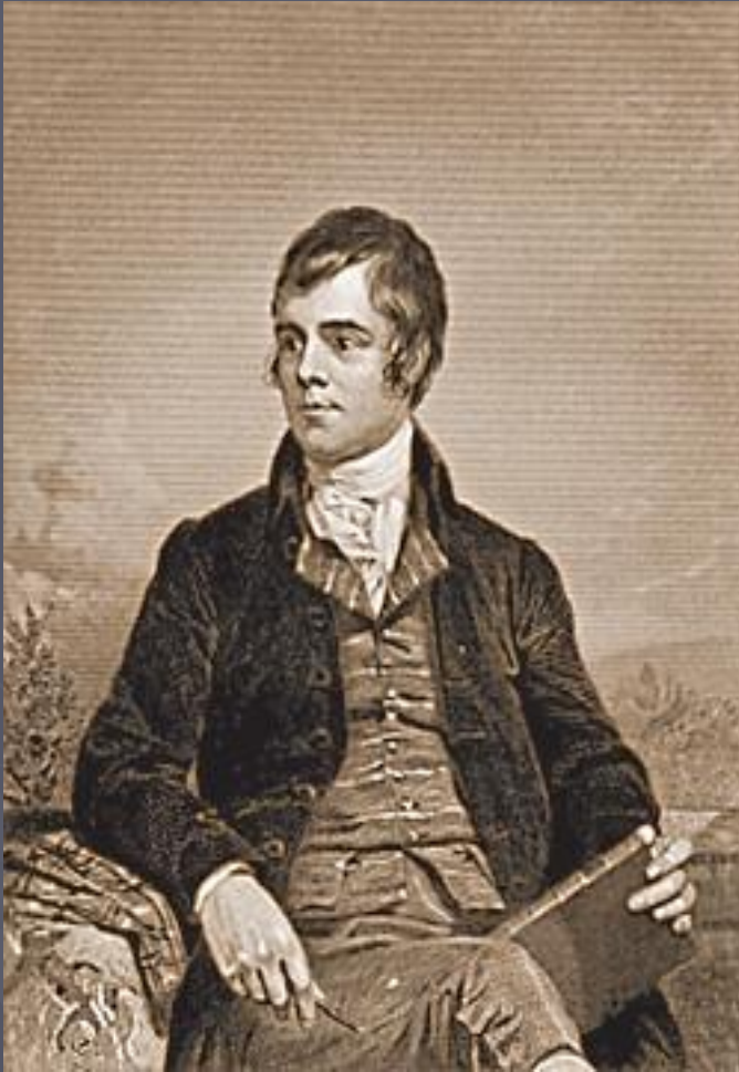
Robert Burns. (1759-1796)