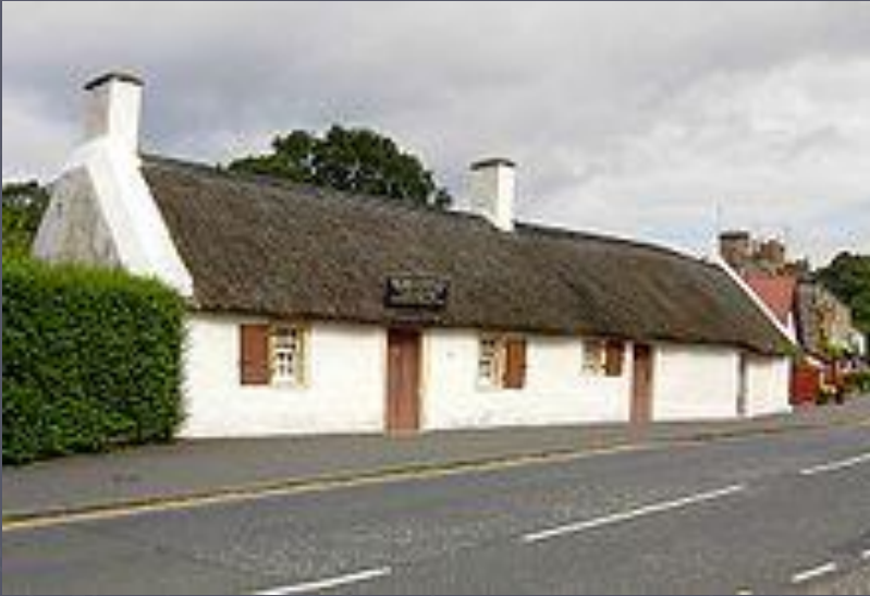
The Burns Cottage.