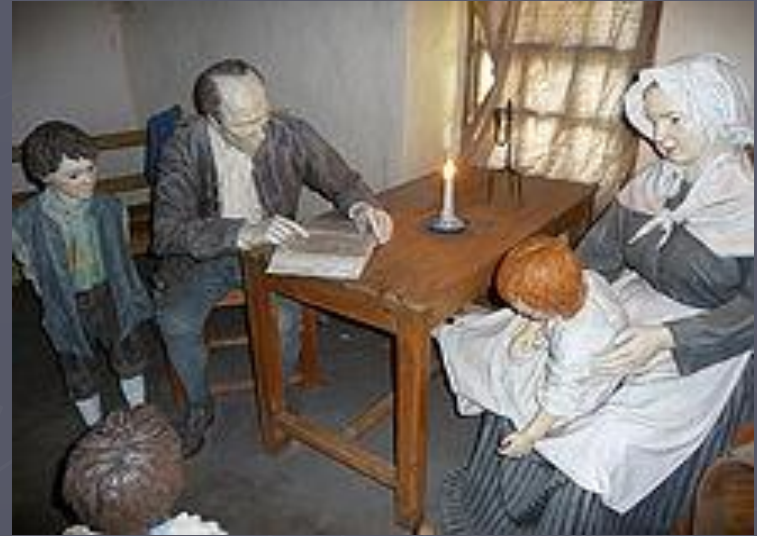
Inside the Burns Cottage Museum