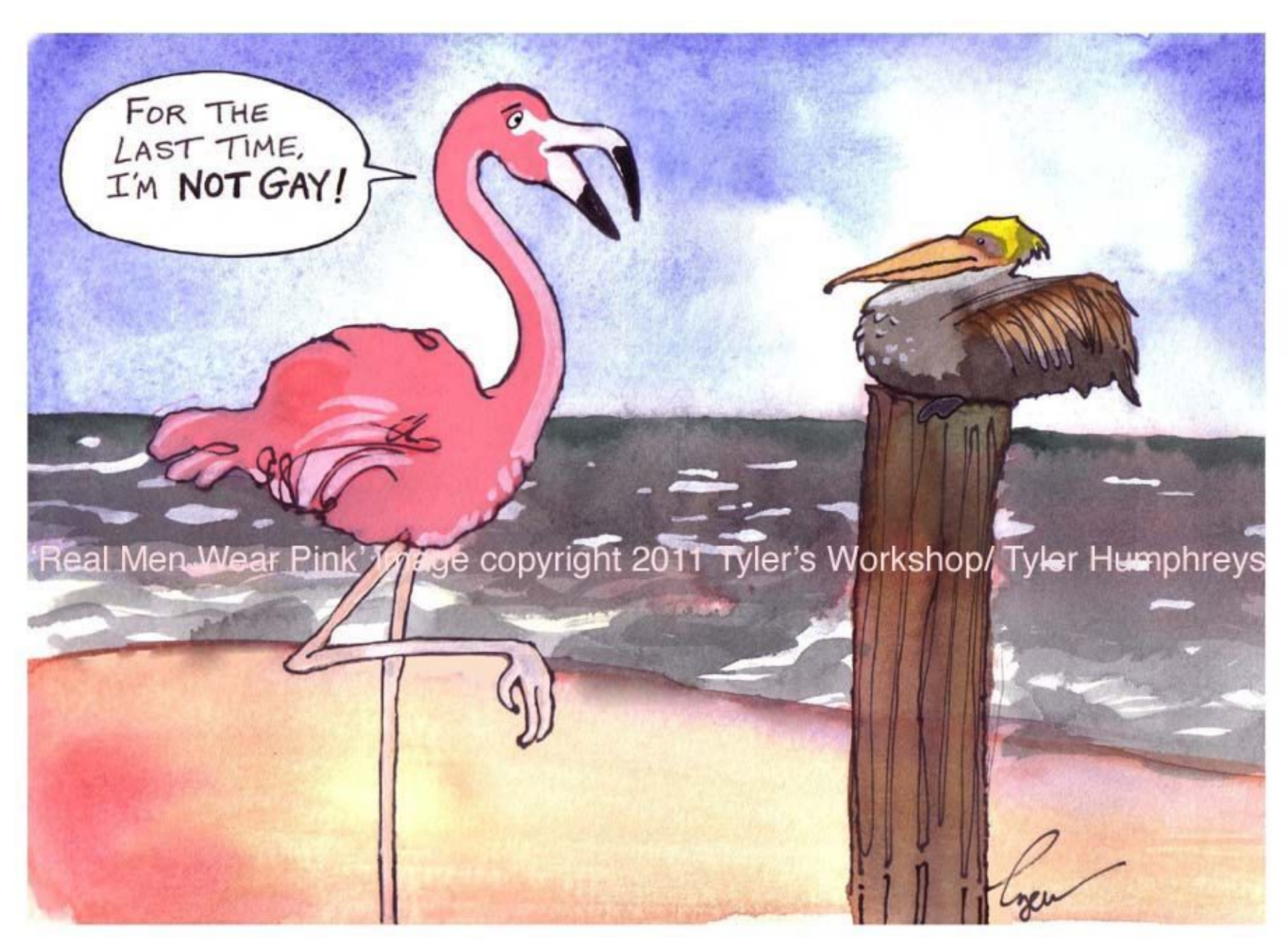
REAL MEN WEAR PINK