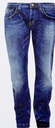
JEANS [dʒi:nz] джинсы