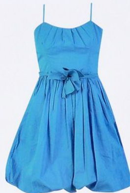
DRESS [dres] платье