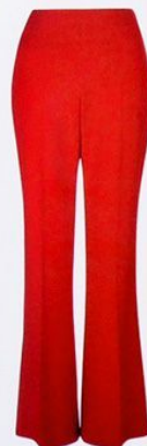
TROUSERS ['traʊzəz] брюки