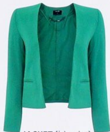
JACKET ['dʒækɪt] жакет/куртка