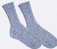
SOCKS [sɒks] носки