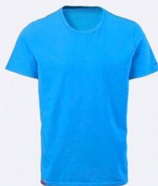
T-SHIRT [ti ʃɜ:t] футболка