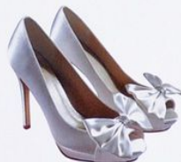
SHOES [ʃu:z] туфли