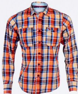
SHIRT [ʃɜ:t] рубашка