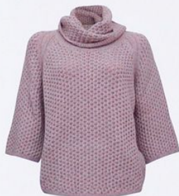
SWEATER ['swetə] свитер