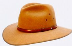
HAT [hæt] шляпа