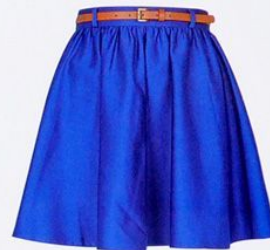
SKIRT [skɜ:t] юбка