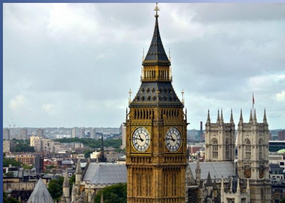
4. Big Ben