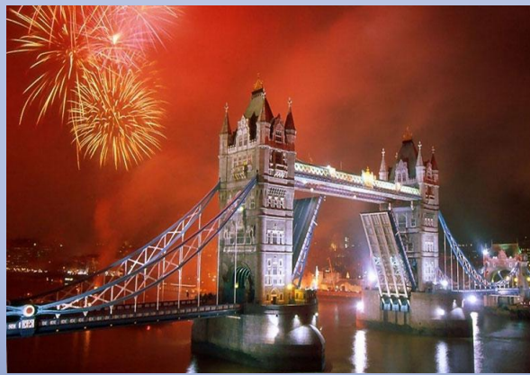
5. Tower Bridge