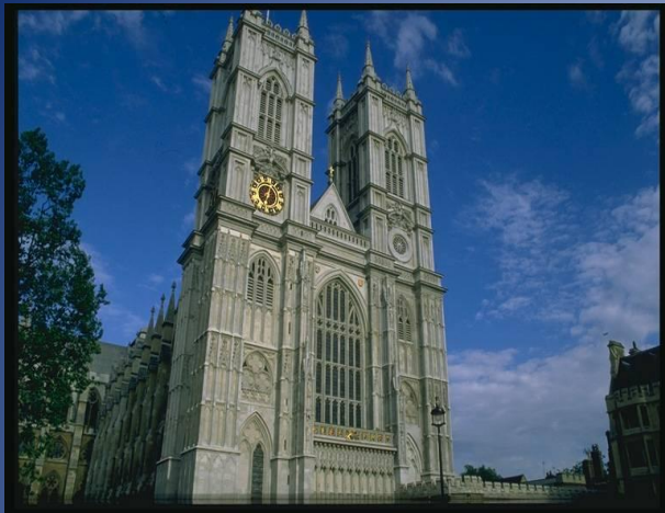
1. Westminster Abbey