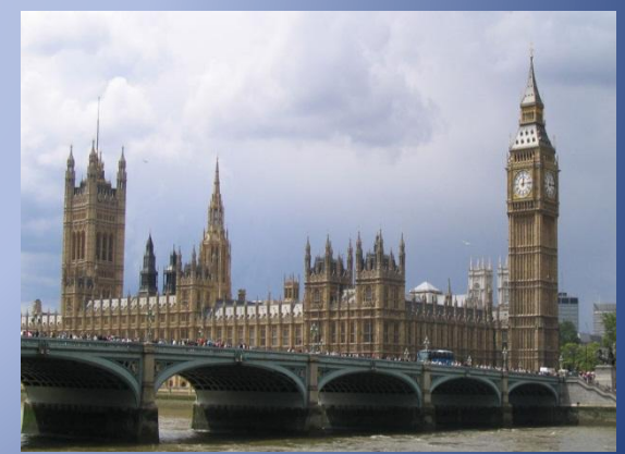
6. The houses of parliament