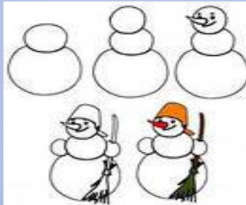
№5 draw pictures