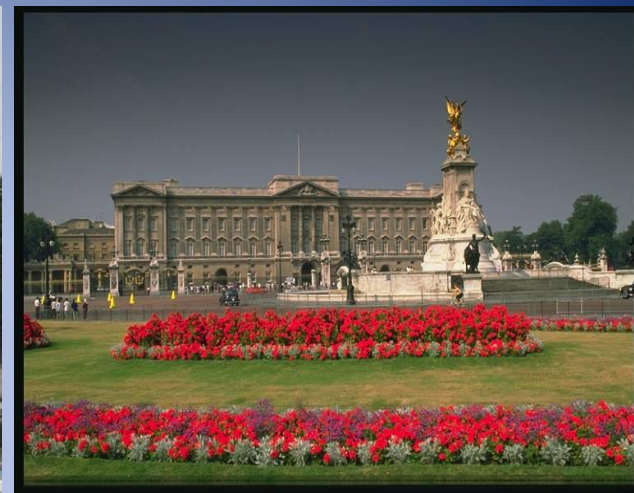
3. Buckingham Palace