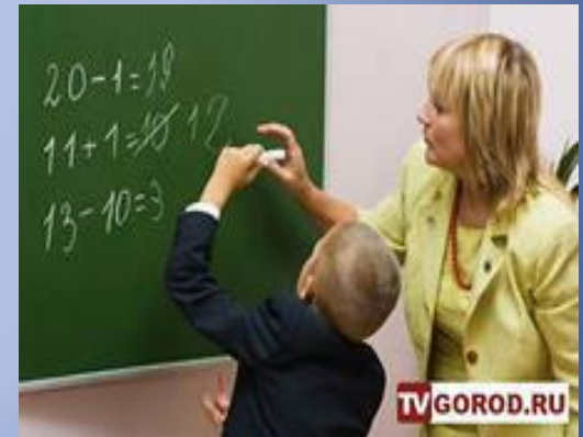
№6 discuss problems