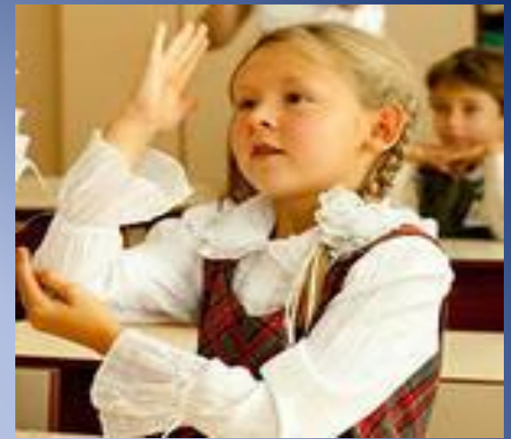
№3 answer the questions