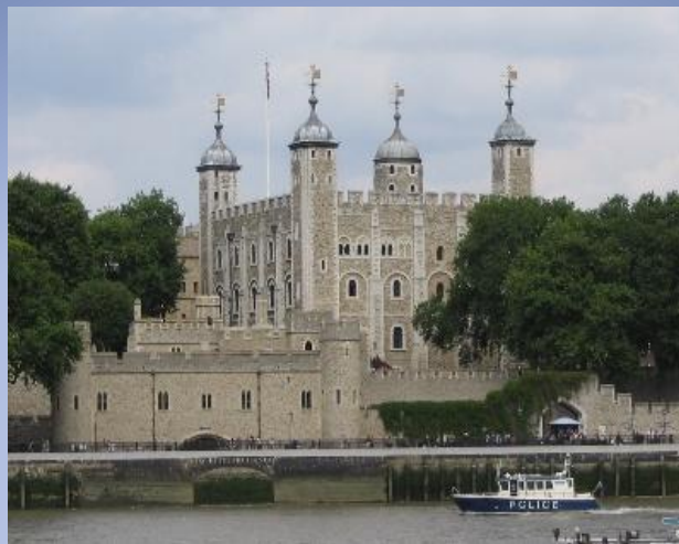
2. The Tower of London