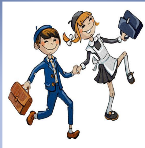
№2 run between the desks