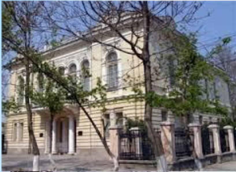
The Simferopol State Art Museum (since 1939)