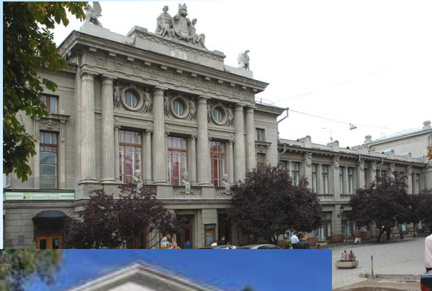
M. Gorky Russian Academic Drama Theatre (since 1911)