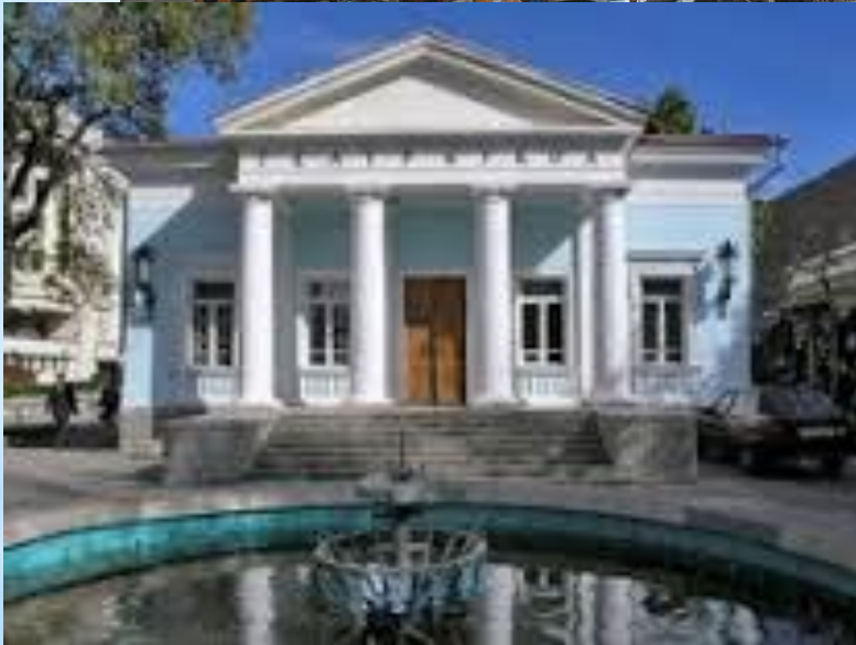
Crimean Academic Puppet Theatre (since 1939)