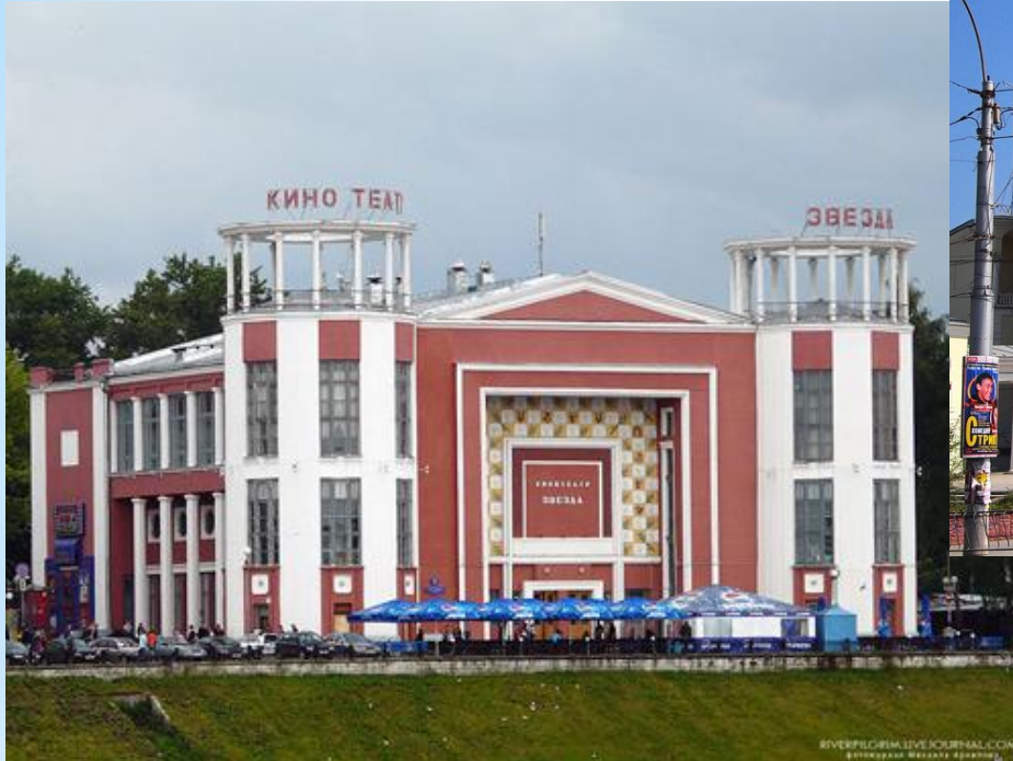
“Zvezda” cinema in Tver’