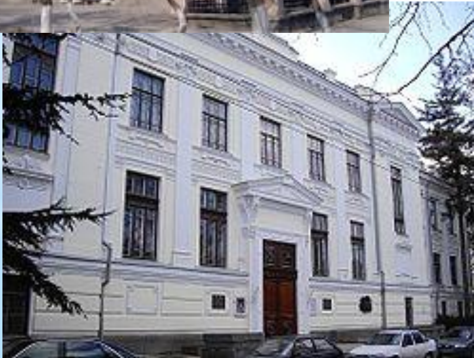
The Central Museum of Taurida (since 1921)