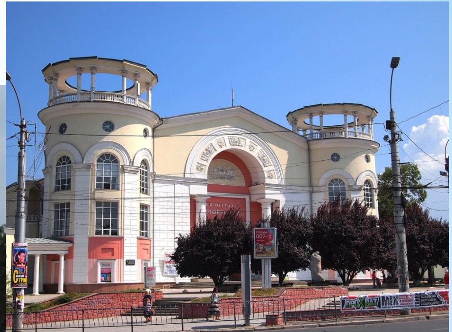
“Simferopol” cinema in Simferopol