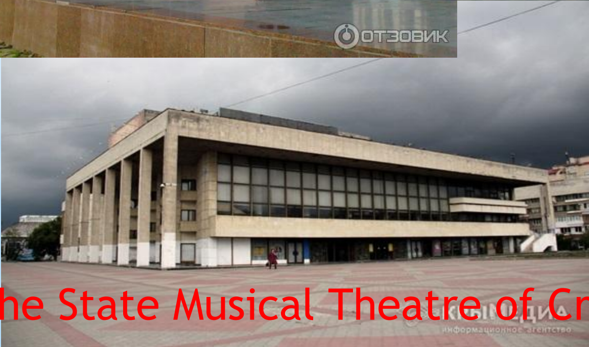
The State Musical Theatre of Crimea