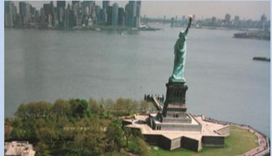
Liberty Enlightening the World