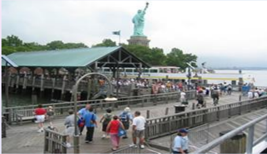
Ferry Dock at Liberty Island