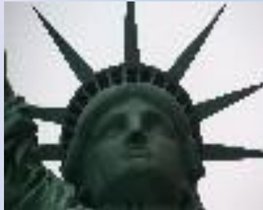
Liberty Face and Crown