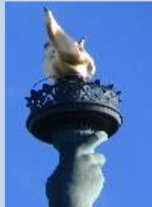
Current torch of Statue of Liberty