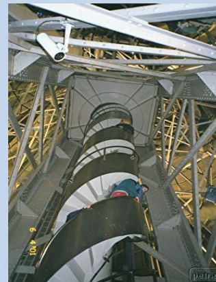
The Statue of Liberty inside