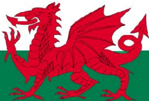
Flag of Wales

St David - Dewi Sant was a Celtic monk, abbot and bishop, who lived in the sixth century. He spread the word of Christianity across Wales