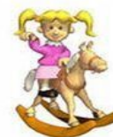
Ride a horse