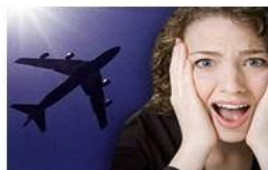
Fly the plane