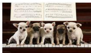
Play the piano

Look at the pictures and say, what you CAN or CAN'T do. Посмотри на картинки и скажи, что ты умеешь и что не умеешь делать.