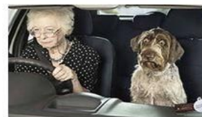
Drive a car