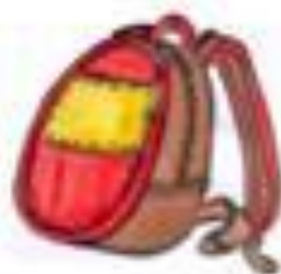
a school bag