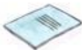
an exercise book