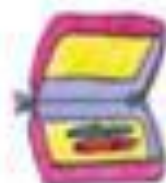
a pencil case