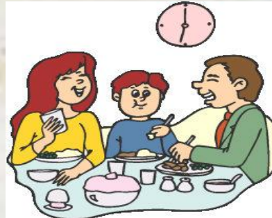
TO HAVE DINNER