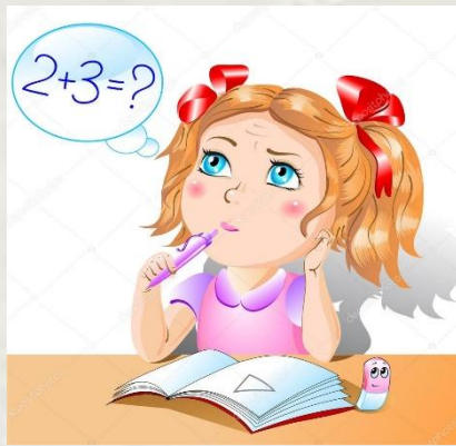
TO DO HOMEWORK