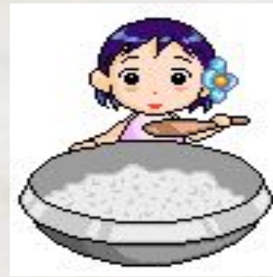
TO HAVE BREAKFAST