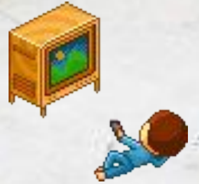
TO WATCH TV