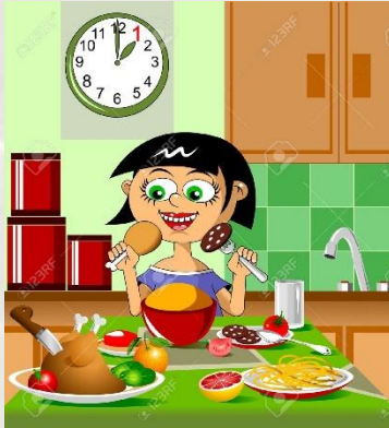
TO HAVE LUNCH