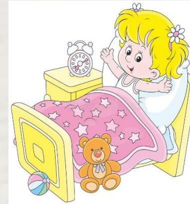
TO GET UP