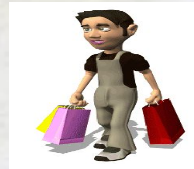
TO GO SHOPPING