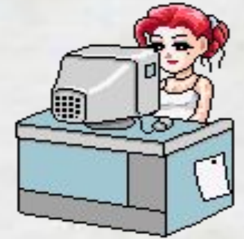
WORK ON COMPUTER