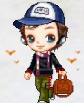
TO GO TO SCHOOL