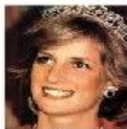
Diana Princess of Wales b. 1 Jul 1961 d. 31 Aug 1997

Married 29 Jul 1981 Divorced 28 Aug 1996