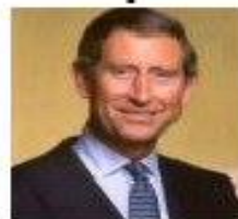
Prince Charles Prince of Wales b. 14 Nov 1948

Prince Philip Duke of Edinburgh b. 10 Jun 1921