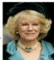
Camilla Duchess of Cornwall b. 17 July 1947