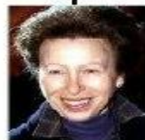
Princess Anne b. 15 Aug 1950

Married 14 Nov 1973 Divorced 28 Apr 1992