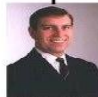
Prince Andrew Duke of York b. 19 Feb 1960

Married 23 Jul 1986 Divorced 30 May 1996