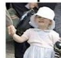
Lady Louise b. 8 Nov 2003