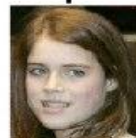
Princess Eugenie b. 23 Mar 1990