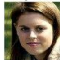
Princess Beatrice b. 8 Aug 1988