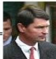
Timothy Laurence b. 1 Mar 1955