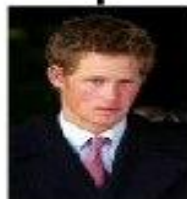
Prince Henry (Harry) b. 15 Sep 1984