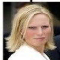
Zara Phillips b. 15 May 1981