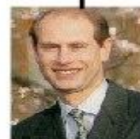
Prince Edward Earl of Wessex b. 10 Mar 1964