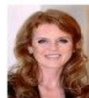
Sarah Duchess of York b. 15 Oct 1959

Married 23 Jul 1986 Divorced 30 May 1996