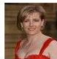
Sophie Countess of Wessex b. 20 Jan 1965