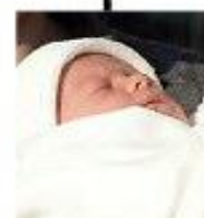
Viscount Severn b. 17 Dec 2007