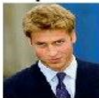
Prince William b. 21 Jun 1982