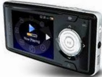
MP 3 player