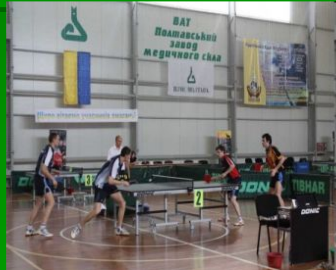
table tennis lawn tennis

Tennis is also very popular in Britain. Two different games that do not have much in common bear the name of tennis - lawn tennis and table tennis. Both games first appeared in England, but today the British prefer lawn tennis to table tennis. Every summer, in June, the biggest tournament in the world takes place at Wimbledon. This world centre of lawn tennis is located in a suburb of London. Millions of people watch the Wimbledon Championship on TV. Table tennis originated in England in 1880. But the British players are not lucky in table tennis international championships