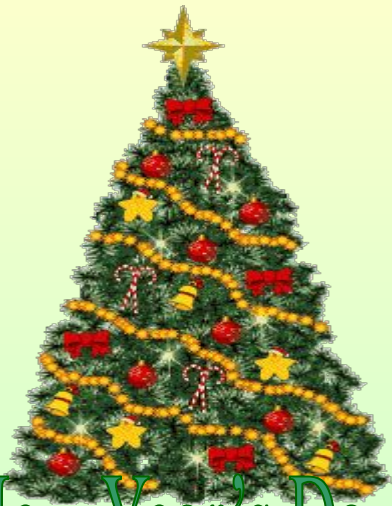
New Year's Day