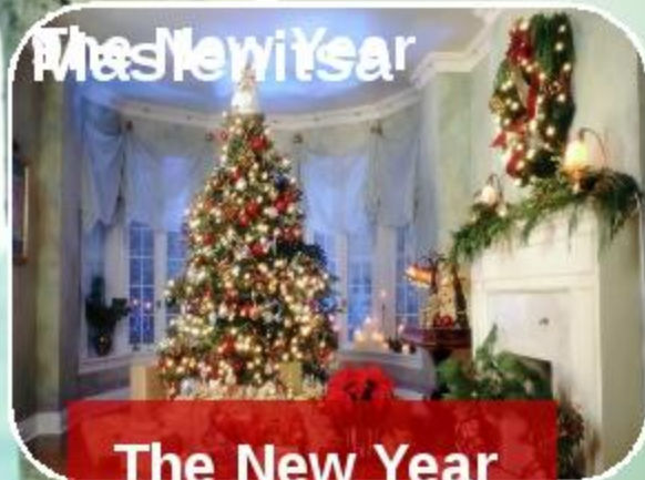
The New Year