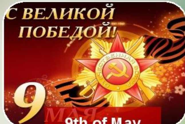
9th of May