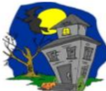
a haunted house