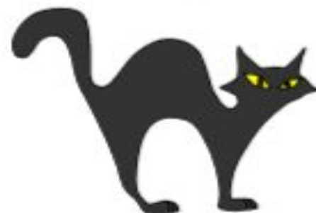
a black cat