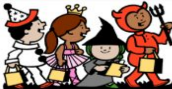
trick or treat