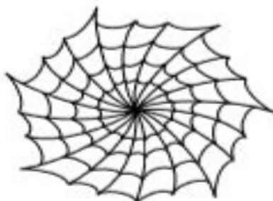
a spider web